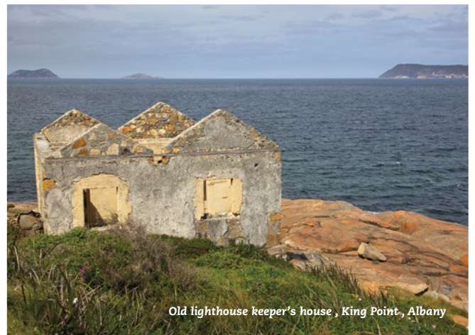
Old lighthouse keeper's house, King Point, Albany