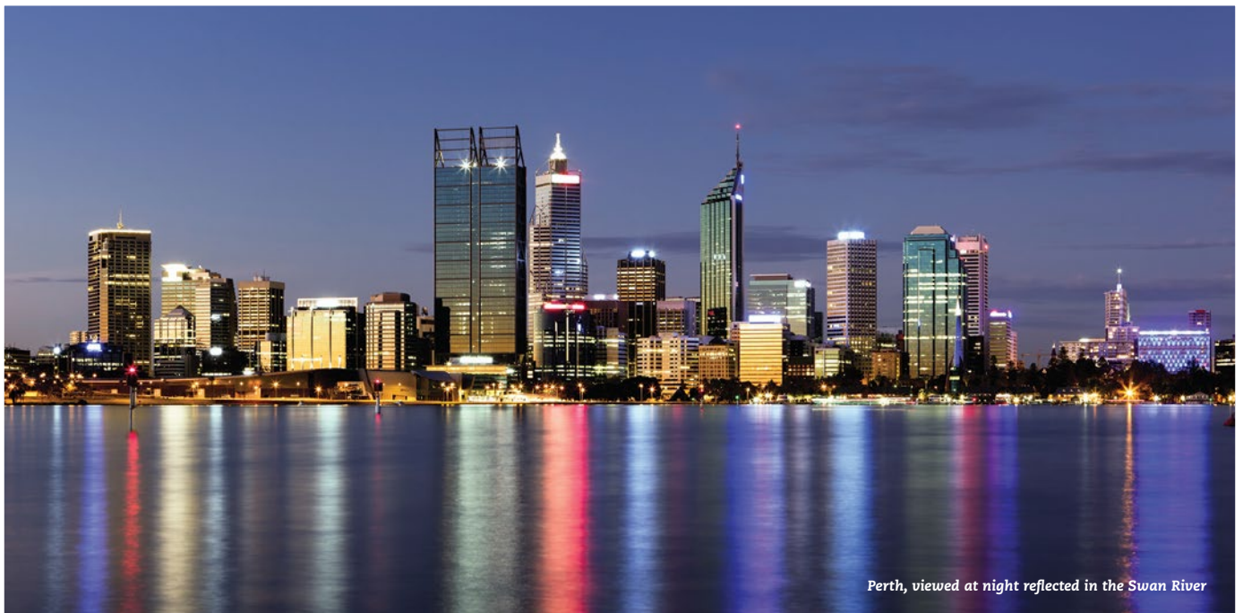
Perth, viewed at night reflected in the Swan River