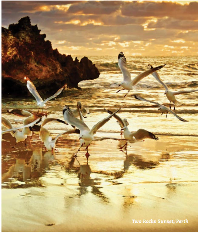
Two Rocks Sunset, Perth