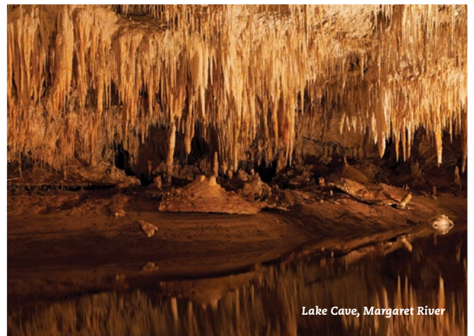
Lake Cave, Margaret River