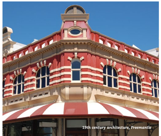
19th century architecture, Fremantle