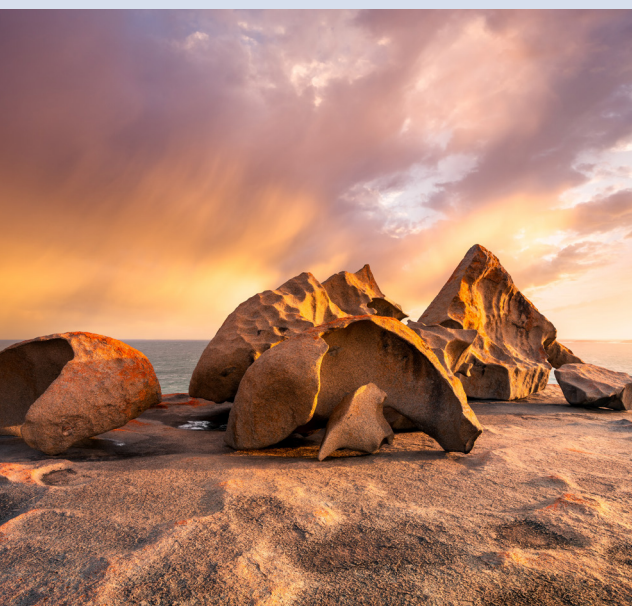
KANGAROO ISLAND LANDSCAPE