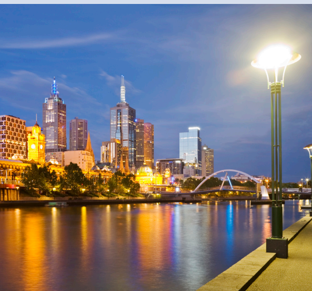
MELBOURNE CITY SKYLINE