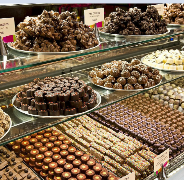
YARRA CHOCOLATE FACTORY