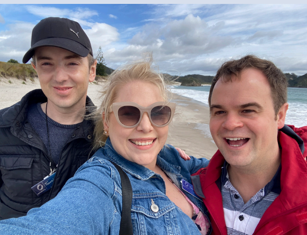
YOUR FUN AND VIBRANT HOSTS