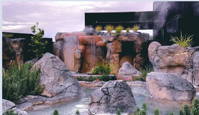
DEEP BLUE HOTEL & HOT SPRINGS