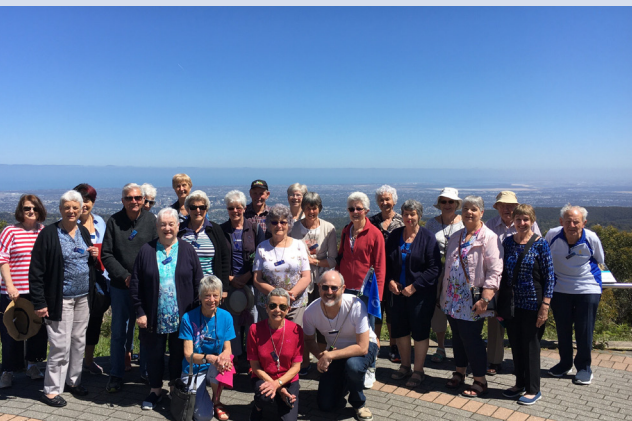
A WONDERFUL GROUP EXPERIENCE