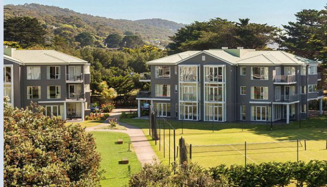
MANTRA LORNE HOTEL