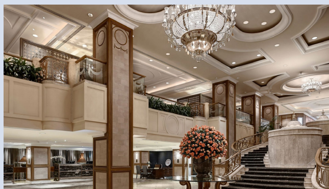
LANGHAM HOTEL MELBOURNE