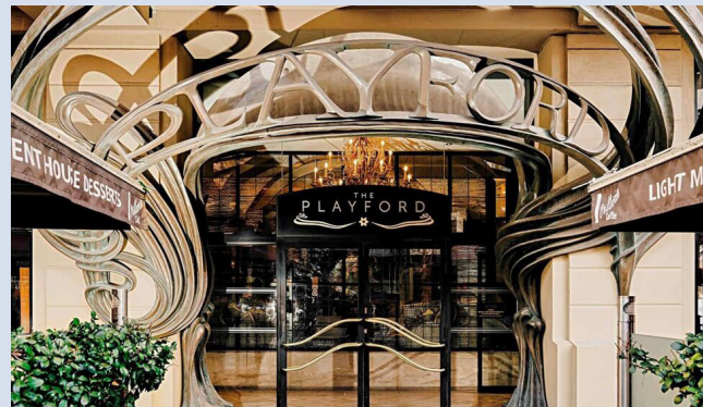
THE PLAYFORD MALLERY BY SOFITEL