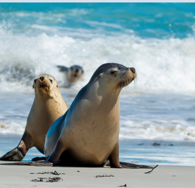
SEAL BAY SEALS