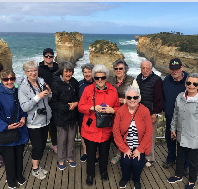
STUNNING CLIFFSIDE SCENERY