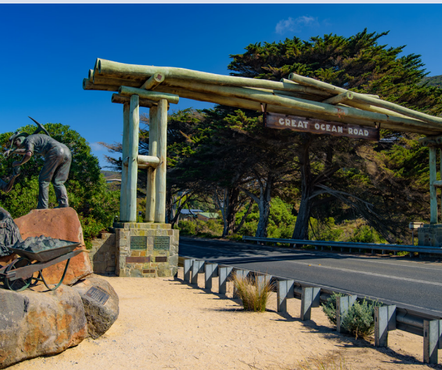
THE GREAT OCEAN ROAD