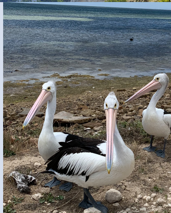
COASTAL BIRD LIFE