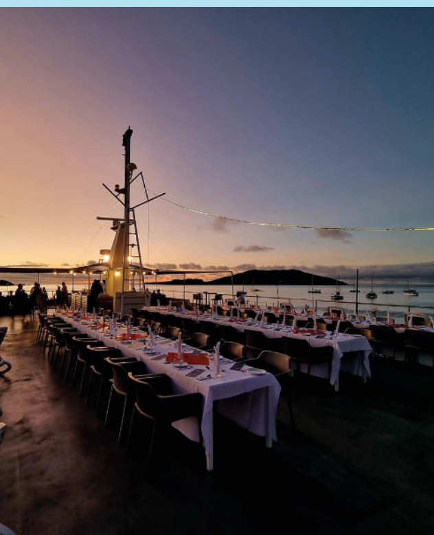
SUNSET DINNER AND CONCERT ON THE UPPER DECK