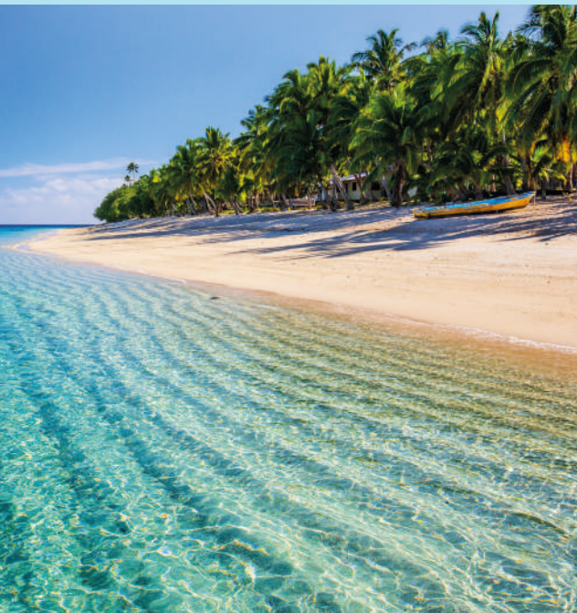
OUR PRIVATE ISLAND