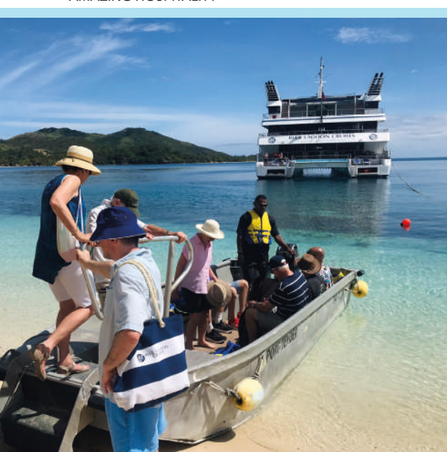
VISITING OUR PRIVATE BEACH