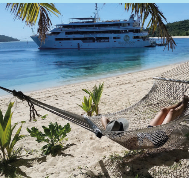
RELAXING ON OUR PRIVATE BEACH