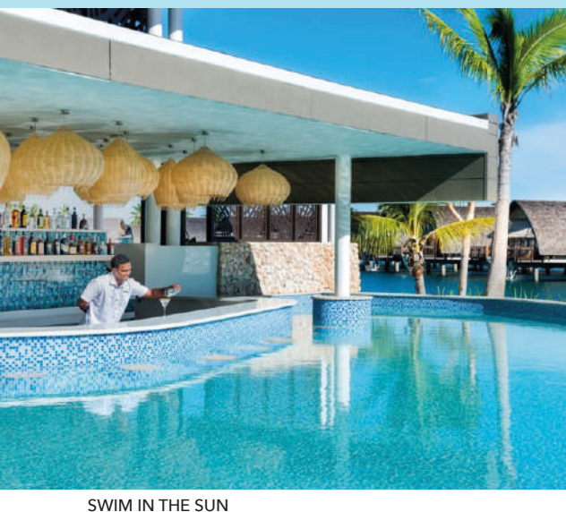
SWIM IN THE SUN