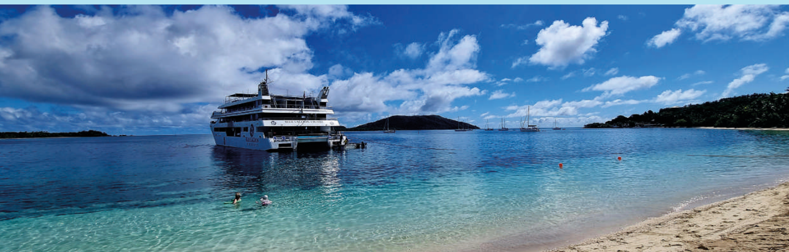
BEACHSIDE LEISURE TIME