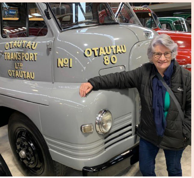
BILL RICHARDSON TRANSPORT WORLD