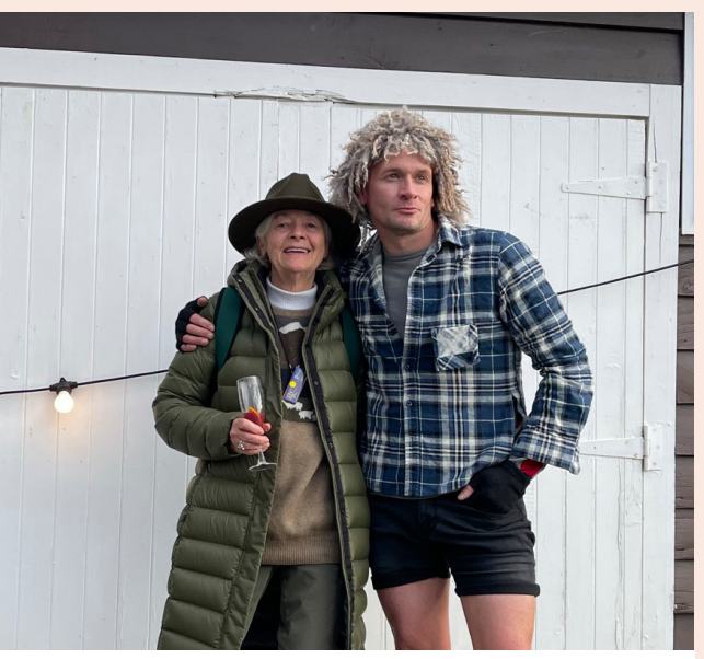
HAVE FUN WITH OUR HOSTS