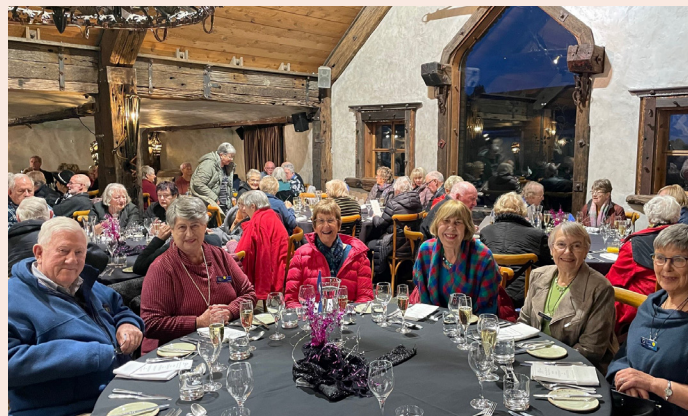
CREATING NEW MEMORIES WITH NEW FRIENDS