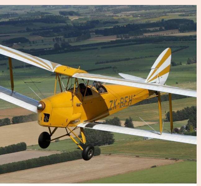
CROYDON AVIATION HERITAGE CENTRE