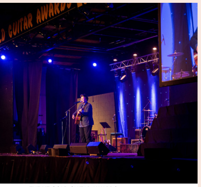
THE NZ GOLD GUITAR AWARDS