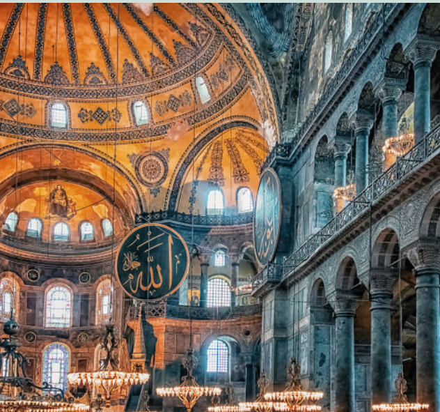
INSIDE THE BLUE MOSQUE