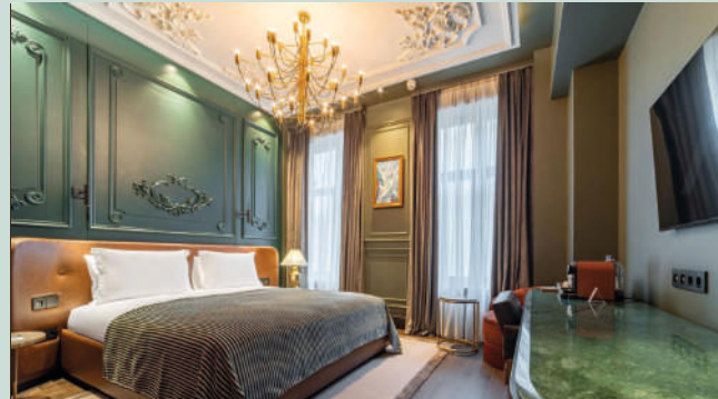
ORIENT OCCIDENT HOTEL AUTOGRAPH

● Yunak Evleri Cave Hotel, Cappadocia (3 nights) is a unique 4-star cave hotel, parts of which date from the 5th century, spans a 19th-century mansion and houses carved into a cliff.