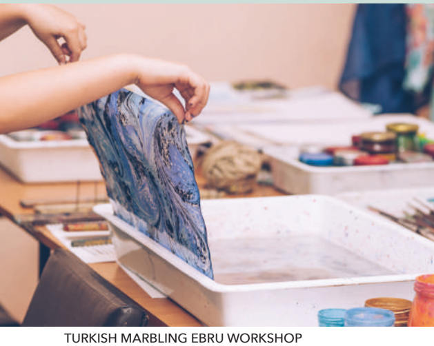
TURKISH MARBLING EBRU WORKSHOP