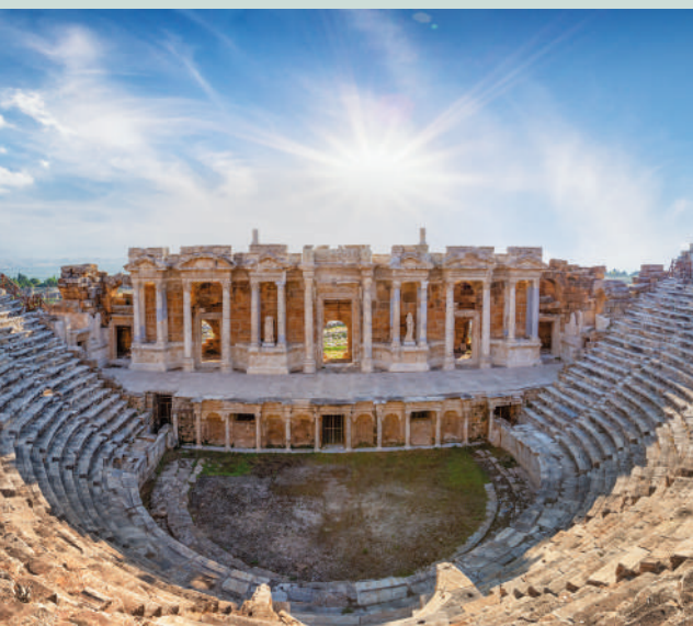
RUINS OF HIERAPOLIS