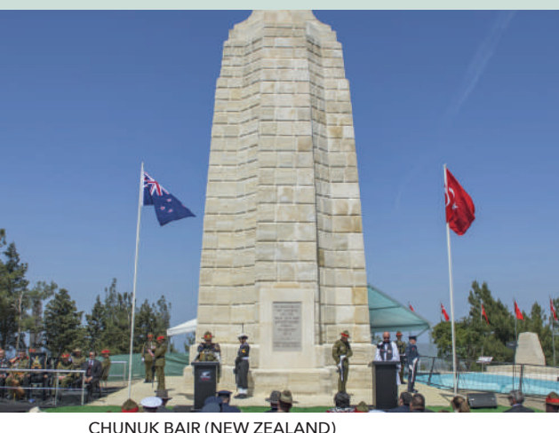
CHUNUK BAIR (NEW ZEALAND)