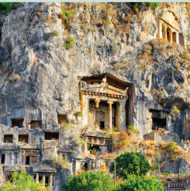
THE TOMB OF AMYNTAS