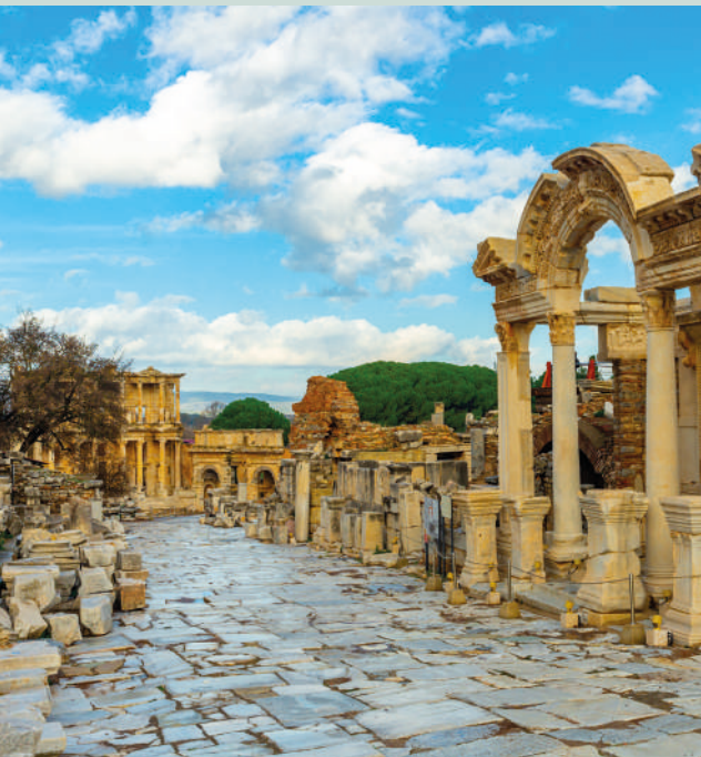
EPHESUS ANCIENT CITY