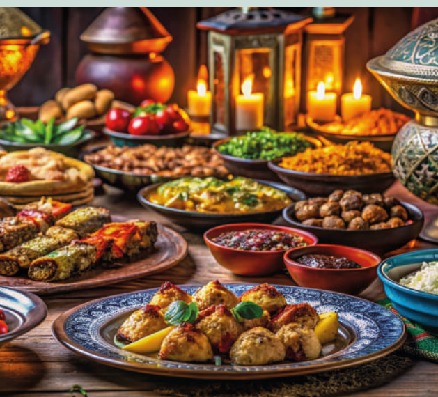
COOKING FOOD FIT FOR A SULTAN