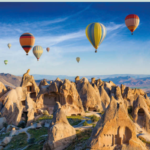
HOT AIR BALLOONING IN CAPPADOCIA