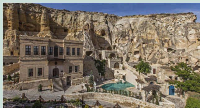
YUNAK EVLERI CAVE HOTEL, CAPPADOCIA