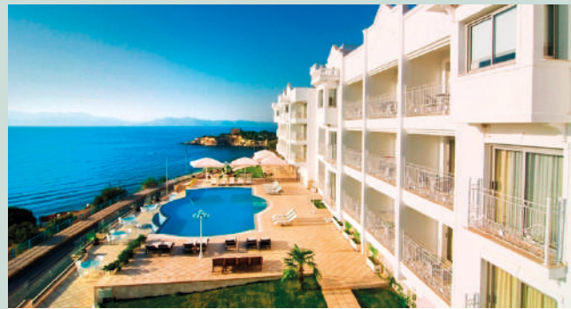
LA VISTA BOUTIQUE HOTEL, KUSADASI