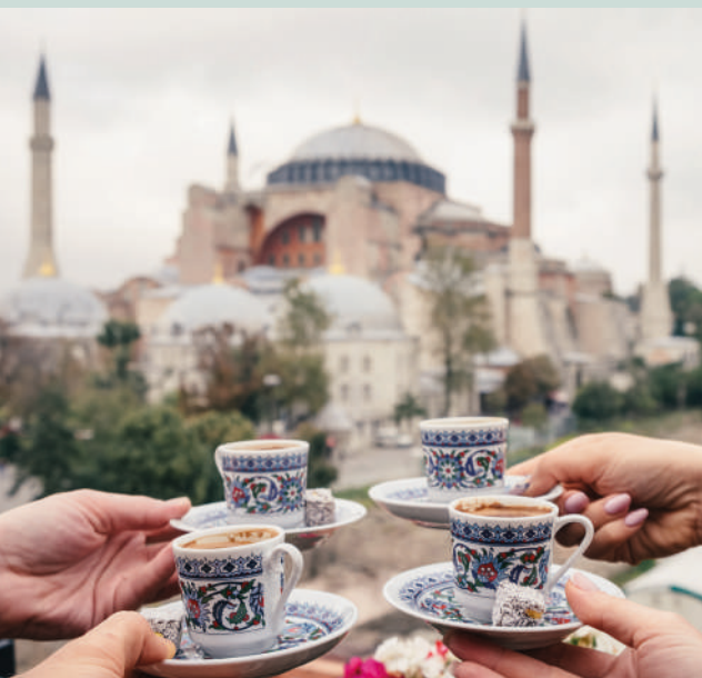
ENJOY A TURKISH COFFEE