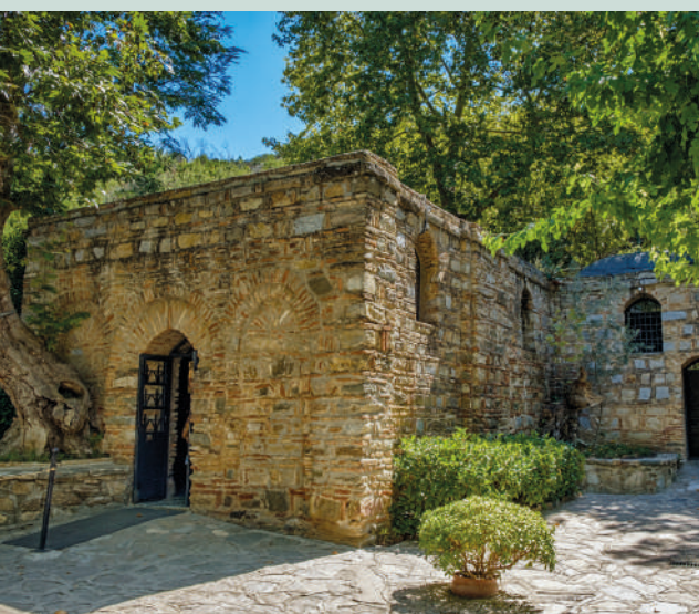
HOUSE OF VIRGIN MARY