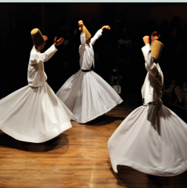
WHIRLING DERVISHES SHOW