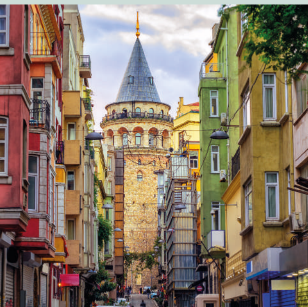
GALATA TOWER IN ISTANBUL