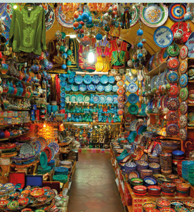
GRAND BAZAAR IN ISTANBUL