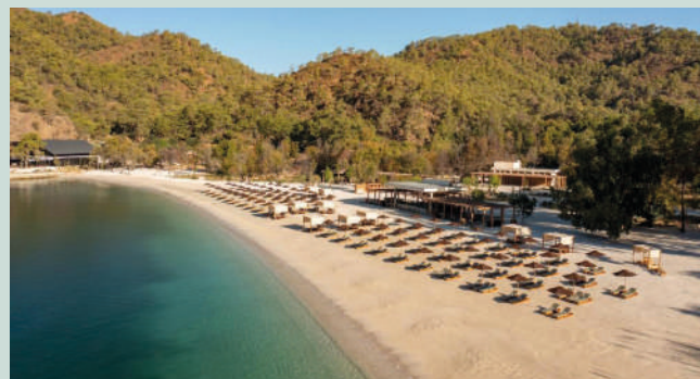
AHAMA LIVING, FETHIYE