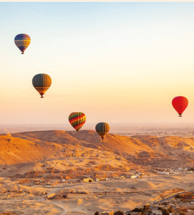
HOT AIR BALLOON OVER THE VALLEY OF THE KINGS