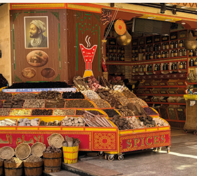
SPICES AT CAIRO BAZAAR