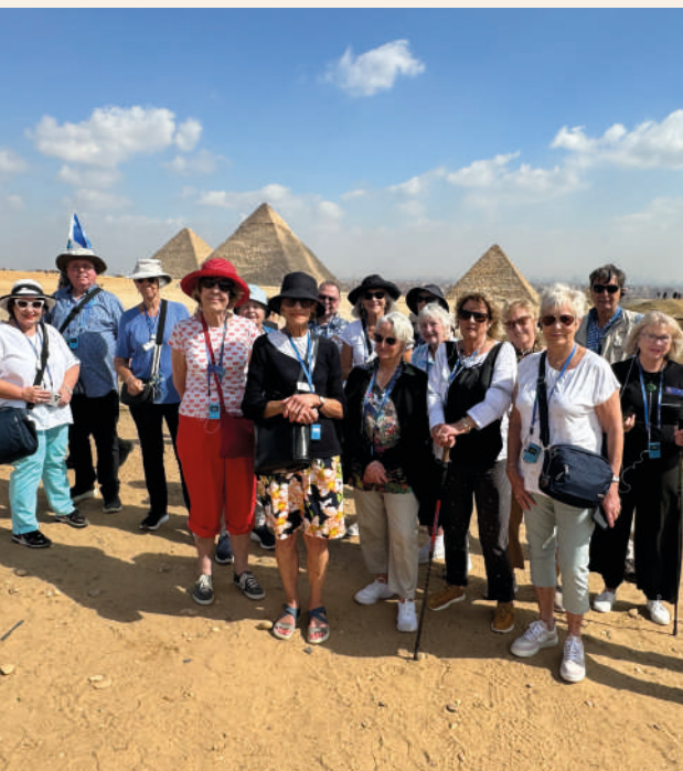
THE AMAZING PYRAMIDS