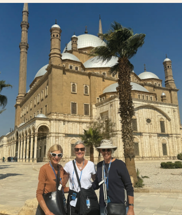
MOSQUE OF MUHAMMAD ALI