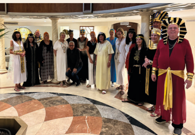
DRESS UP IN YOUR FAVOURITE EGYPTIAN OUTFIT