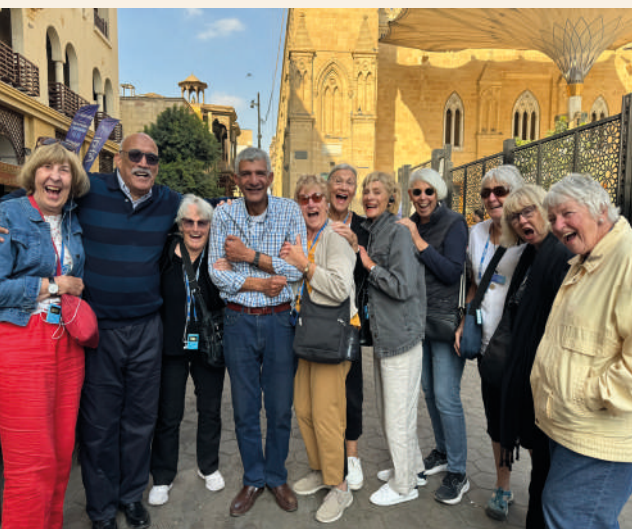
TRAVELLING WITH NEW FRIENDS