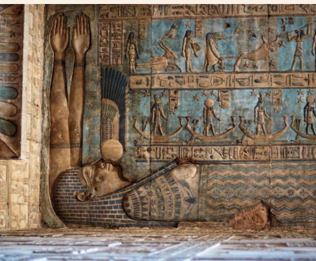
INSIDE DENDERA TEMPLE