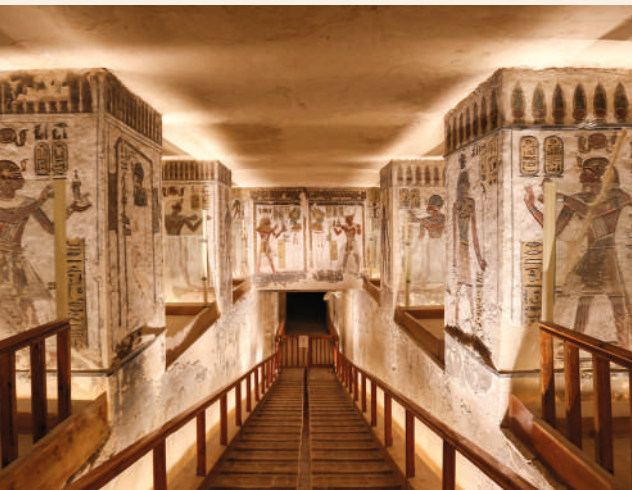
TOMB IN VALLEY OF THE KINGS