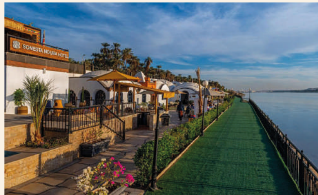
SONESTA NOUBA HOTEL, ASWAN

This is a five-star, boutique hotel, where each of the 45 guest rooms is designed in traditional Nubian style and offers a private terrace and sought-after Nile views from every vantage point.