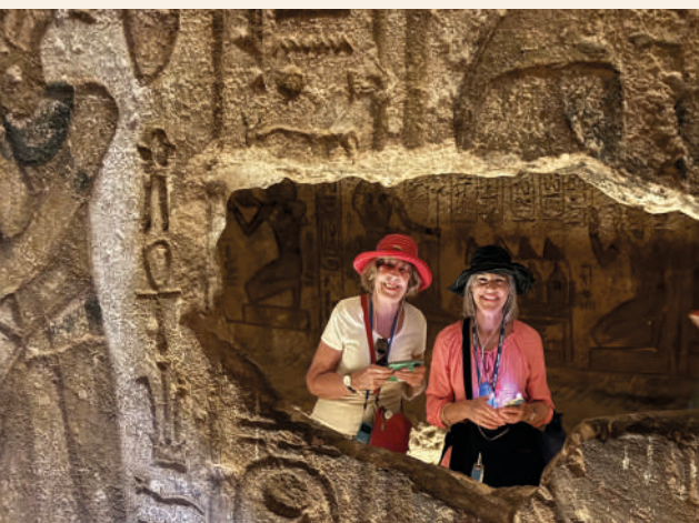
INSIDE ABU SIMBEL