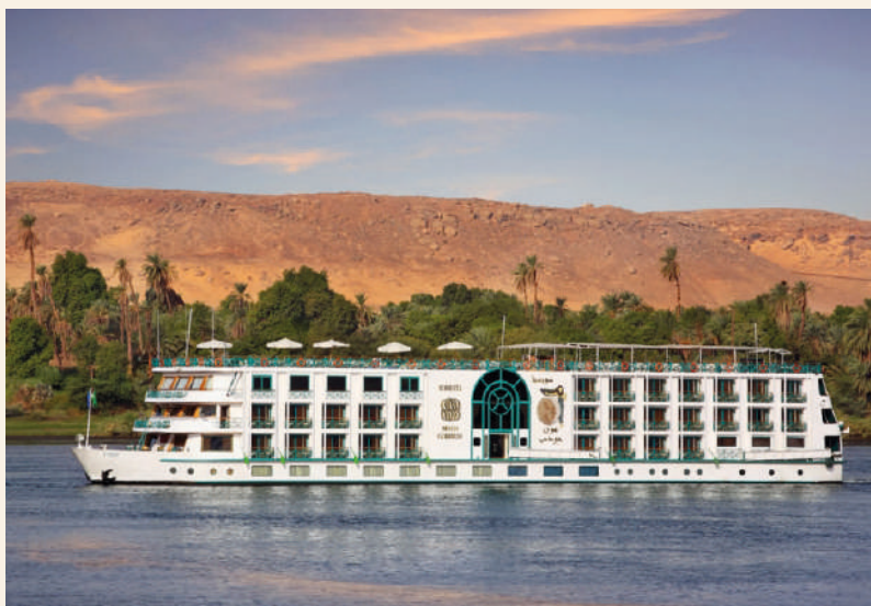
SONESTA MOON GODDESS CRUISE SHIP