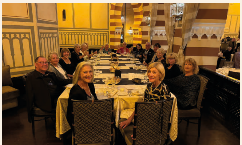
FINAL NIGHT DINNER