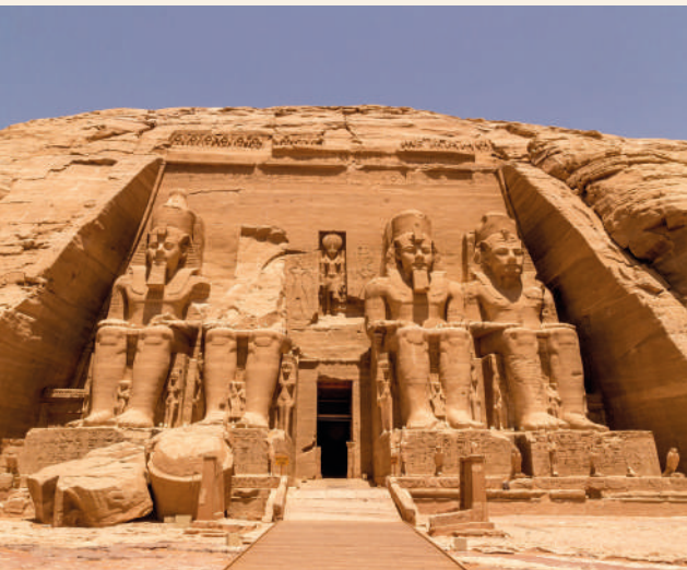
ABU SIMBEL TEMPLE