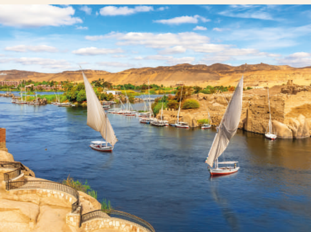
NILE AT ASWAN