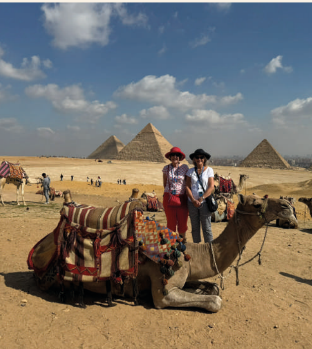
A CHANCE TO RIDE A CAMEL