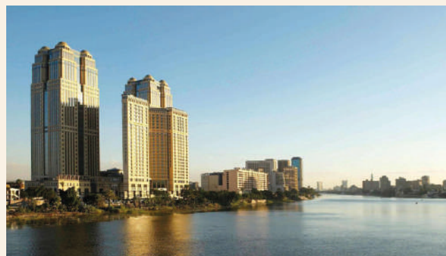
FAIRMONT NILE CITY HOTEL, CAIRO

Located in the Nile City Towers by the River Nile, this 5-star hotel features a rooftop pool deck with spectacular views across Cairo to the Pyramids.