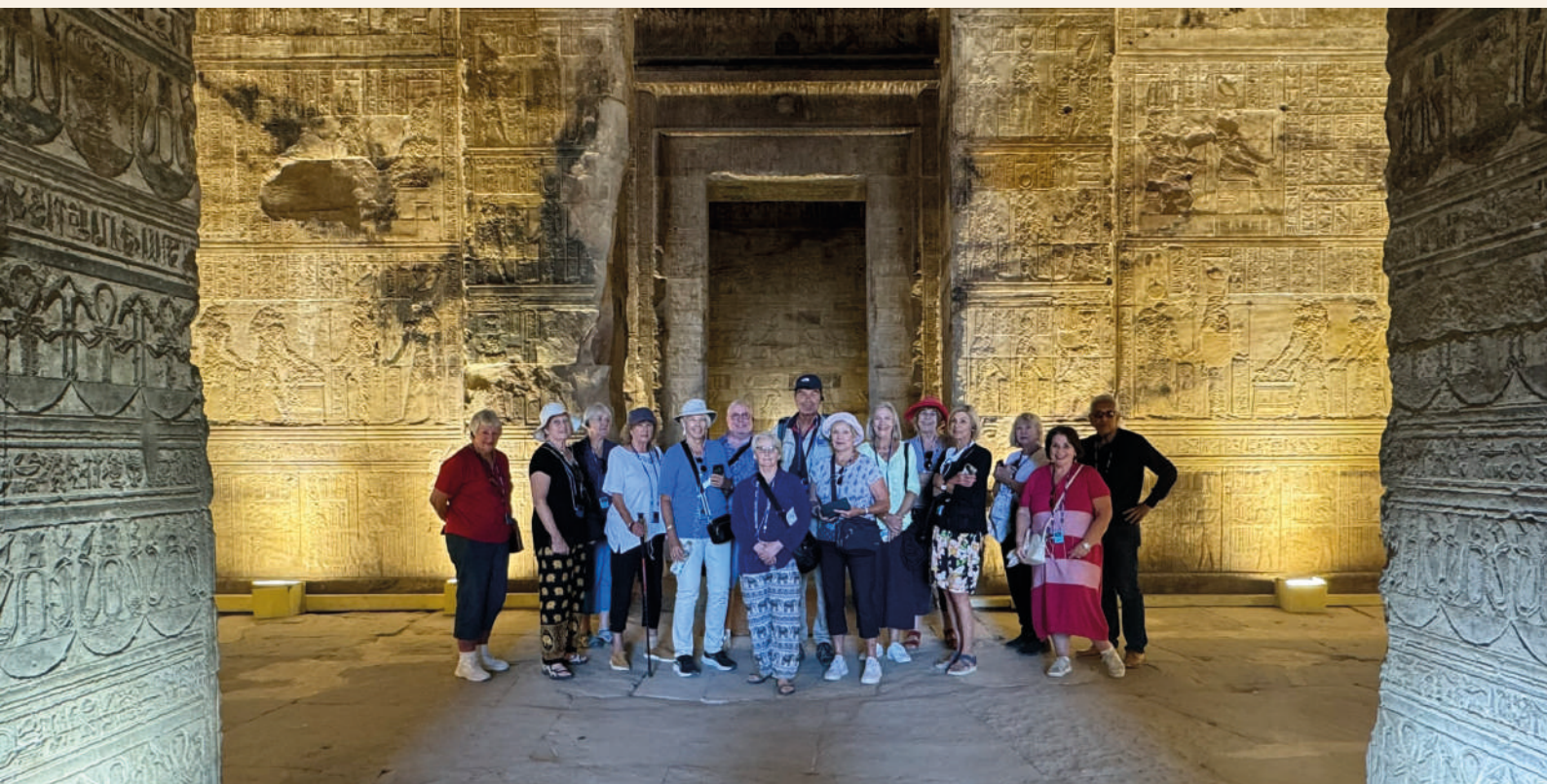
WHAT AN INCREDIBLE TRIP!