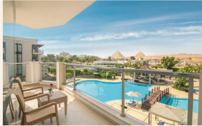
STEIGENBERGER PYRAMIDS HOTEL, CAIRO

This 5-star hotel is nestled amidst the iconic pyramids, and boasts lavish rooms and suites that exude elegance and comfort. We enjoy pyramid view rooms at the hotel, which will make us feel like we have really arrived in Egypt.