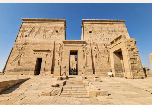
TEMPLE OF PHILAE