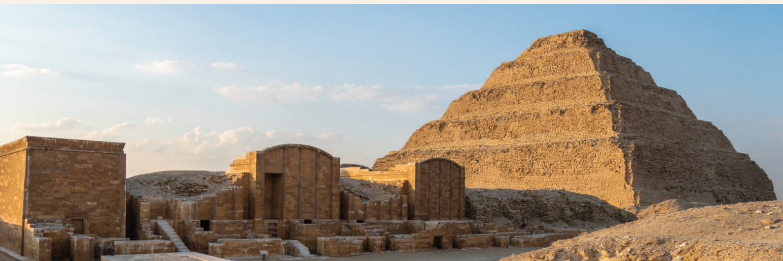
STEP PYRAMID OF DJOSER