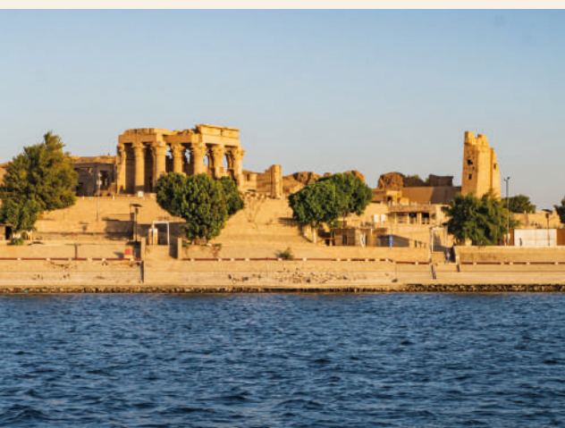
KOM OMBO TEMPLE