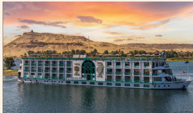
SONESTA MOON GODDESS CRUISE SHIP

Our home for four wonderful nights we enjoy the luxury of one of the most elegant ships on the Nile. All cabins have sliding doors that open to an outside veranda that serves to bring the sounds and scents of Egypt to us. We enjoy deluxe rooms on this boat.