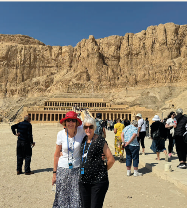
TEMPLE OF QUEEN HATSHEPSUT