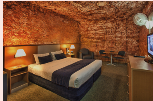
DESERT CAVE HOTEL