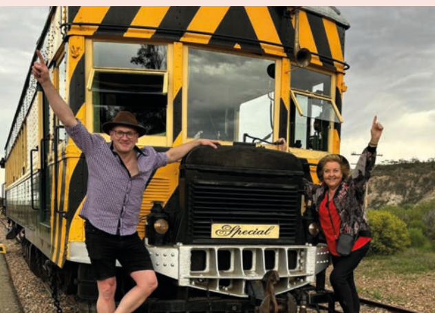
ALL ABOARD THE PICHI RICHI RAILWAY