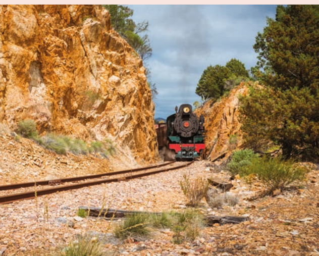
PICHI RICHI RAILWAY