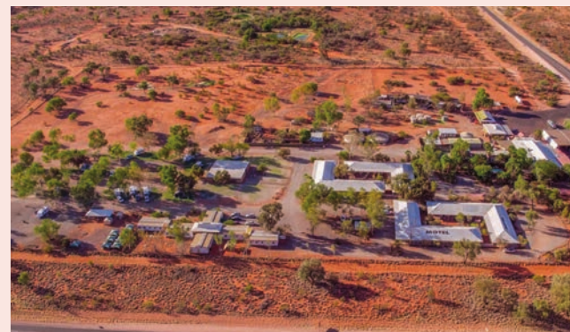
ERLDUNDA DESERT OAKS RESORT