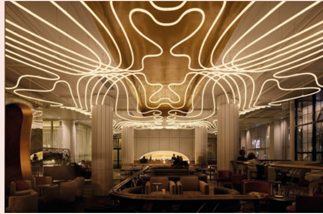
THE PLAYFORD MALLERY