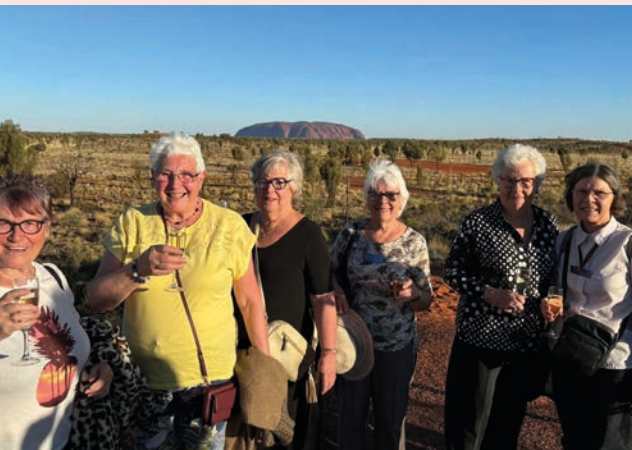
THE AMAZING ULURU