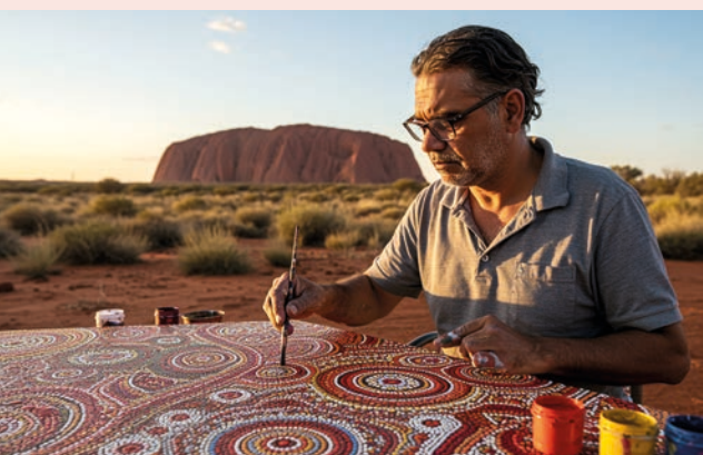
DOT PAINTING LESSON