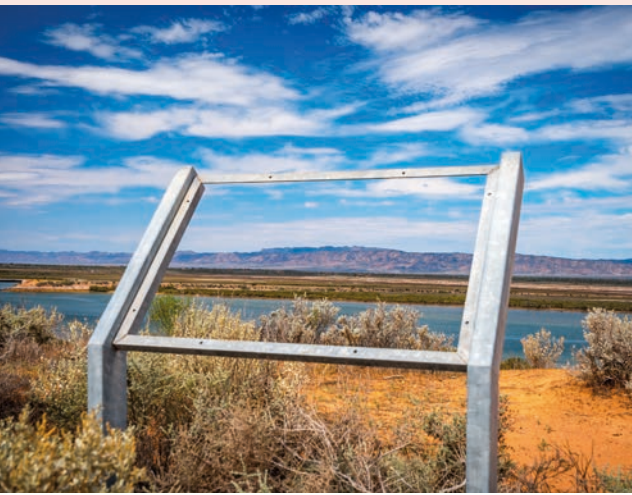
MATTHEW FLINDERS RED CLIFF LOOKOUT