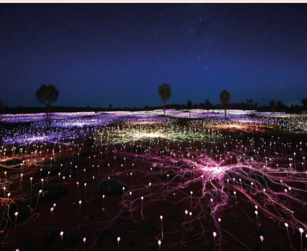
FIELD OF LIGHT