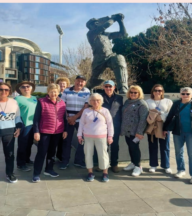
VISIT THE ADELAIDE OVAL