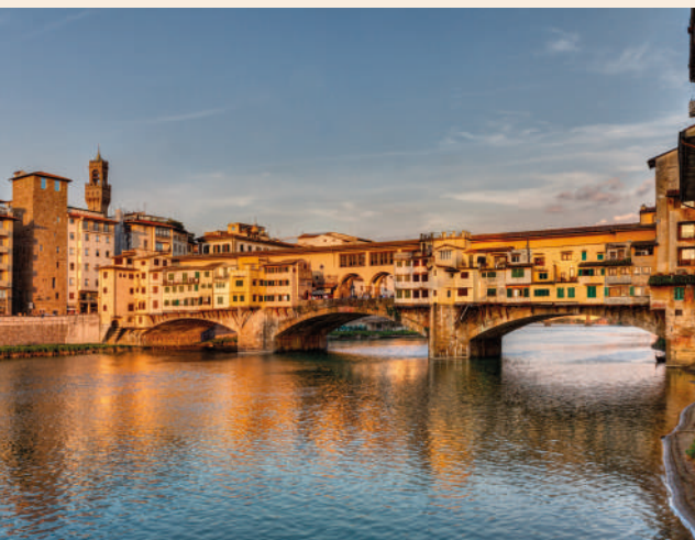
PONTE VECCHIO, FLORENCE