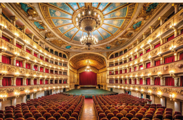
LA FENICE OPERA HOUSE