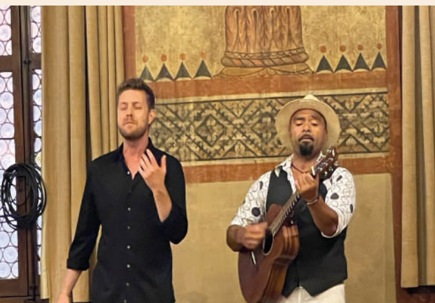
DINNER WITH OUR TENORS