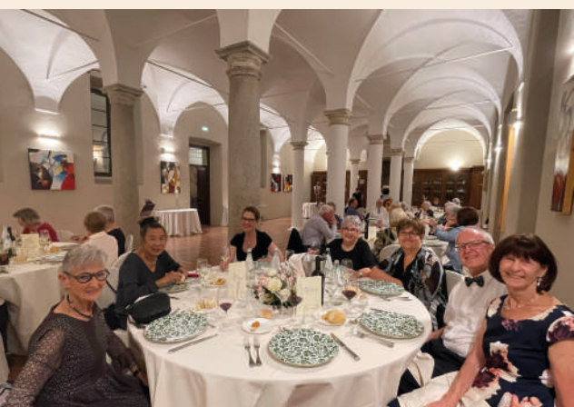
GALA DINNER AT THE ABBEY