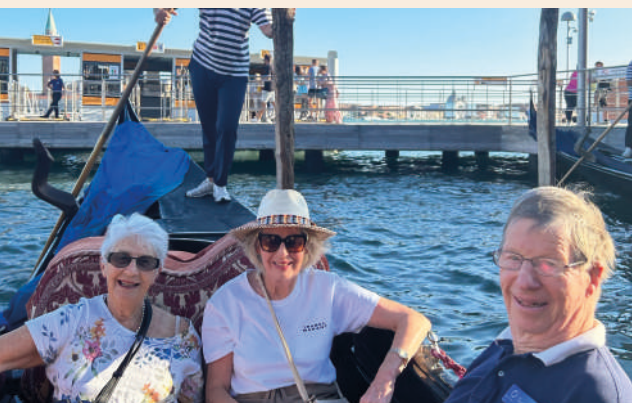
ENJOY A GONDOLA RIDE