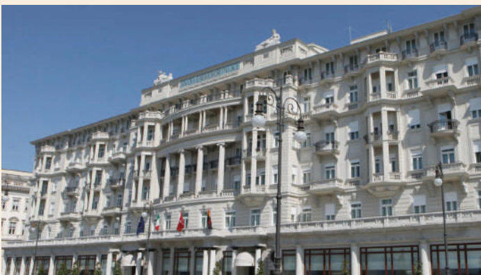
SAVOIA EXCELSIOR PALACE HOTEL