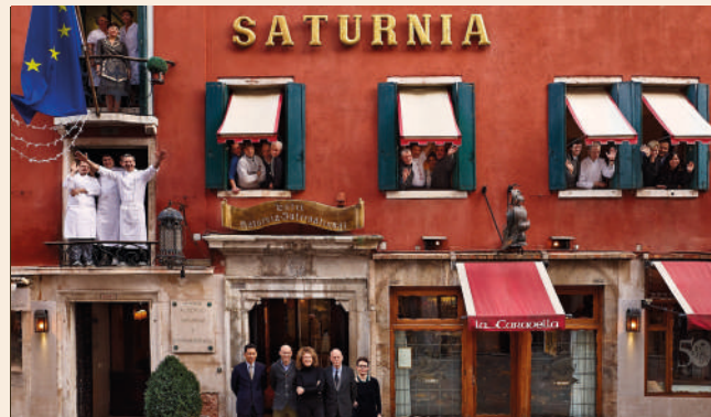
HOTEL SATURNIA & INTERNATIONAL