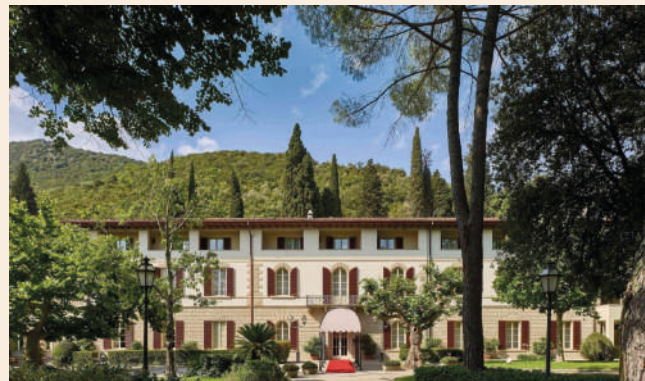
GROTTA GIUSTI THERMAL SPA RESORT