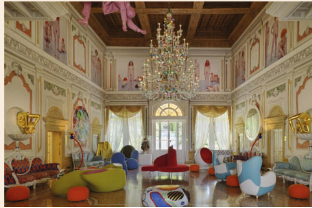
BYBLOS ART HOTEL VILLA AMISTA