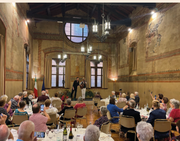
PRIVATE GALA IN SALA DEL CAPITANO DEL POPOLO