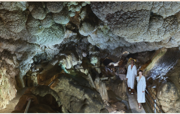
TIME TO RELAX IN THE GROTTA