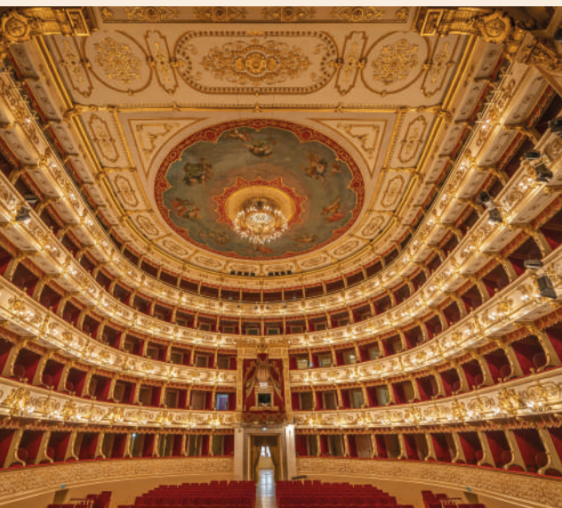
TEATRO REGIO, PARMA