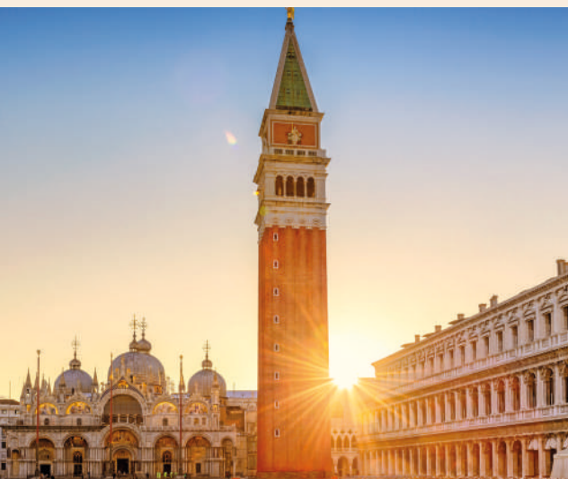
ST MARK'S SQUARE