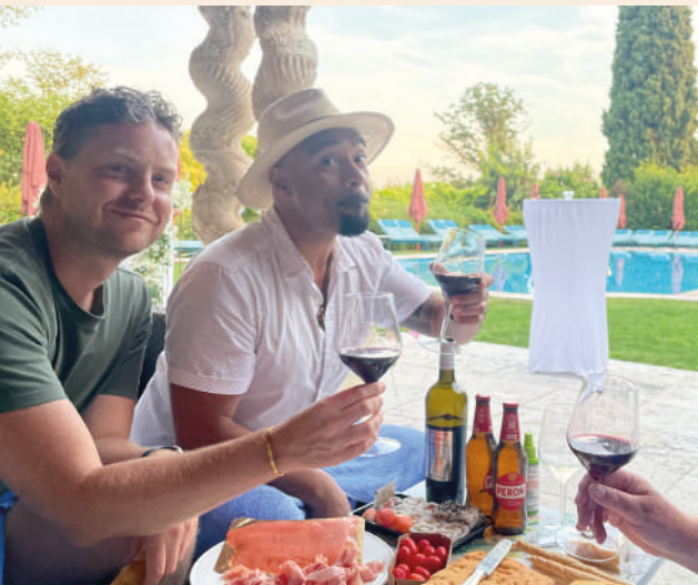
ENJOY ITALIAN WINE WITH OUR HOSTS