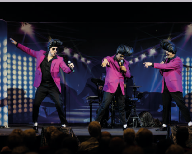
LET'S TWIST AGAIN!