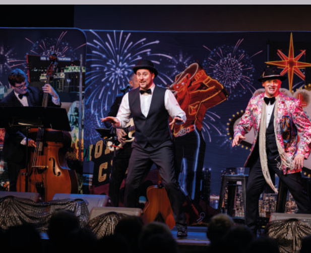
VIVA LAS VEGAS!