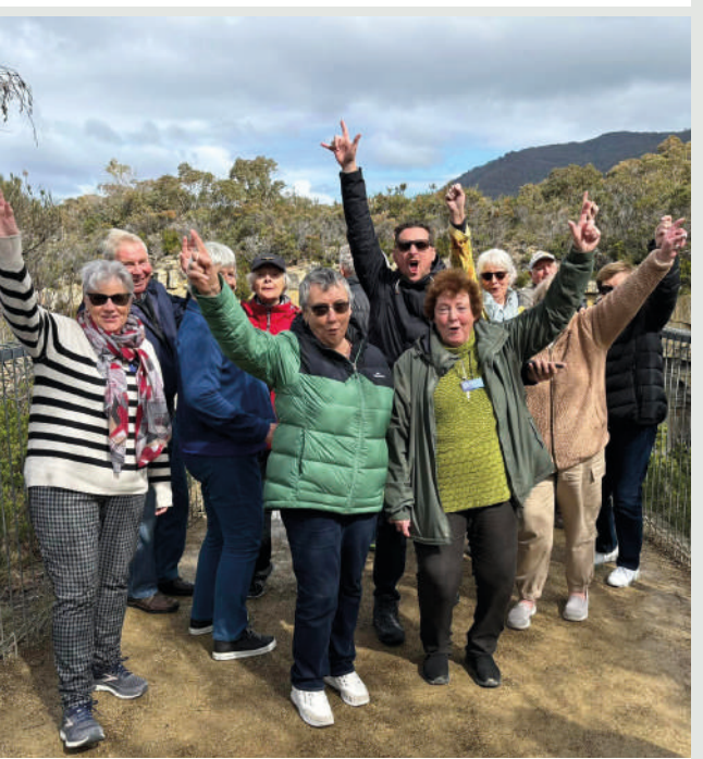
EXPLORE THE BEAUTIFUL SCENERY