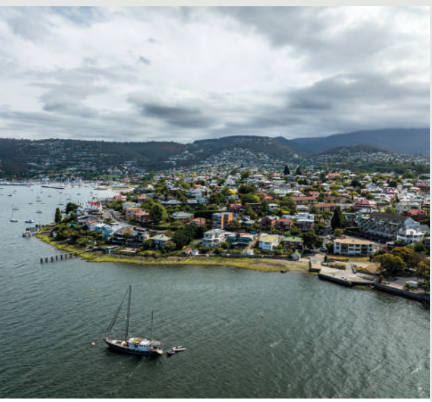
BATTERY POINT, HOBART