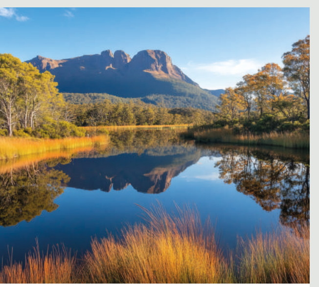
CRADLE MOUNTAIN NATIONAL PARK