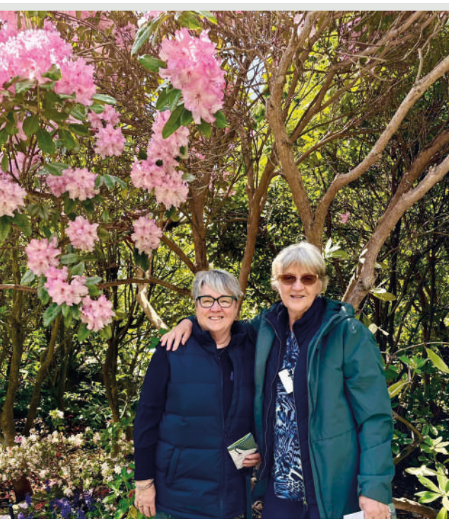
DISCOVER THE BEAUTIFUL BLOOMS