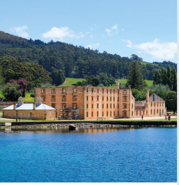
PORT ARTHUR CONVICT SETTLEMENT