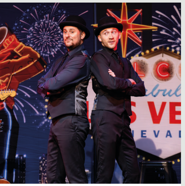
EXPERIENCE OUR CONCERT SHOWSTOPPERS!