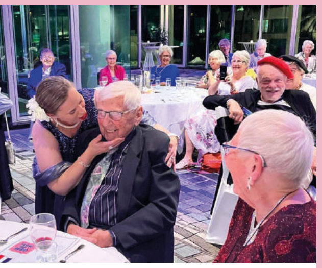
OUR CONCERT, HITS FROM AROUND THE WORLD