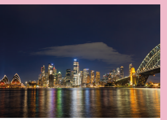
SYDNEY HARBOUR AT NIGHT