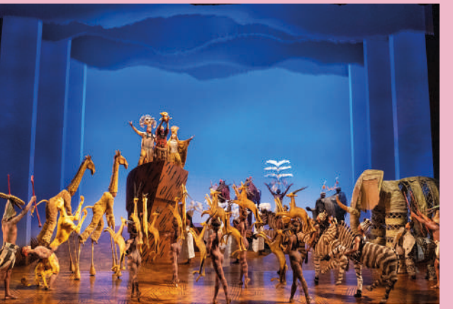
THE LION KING