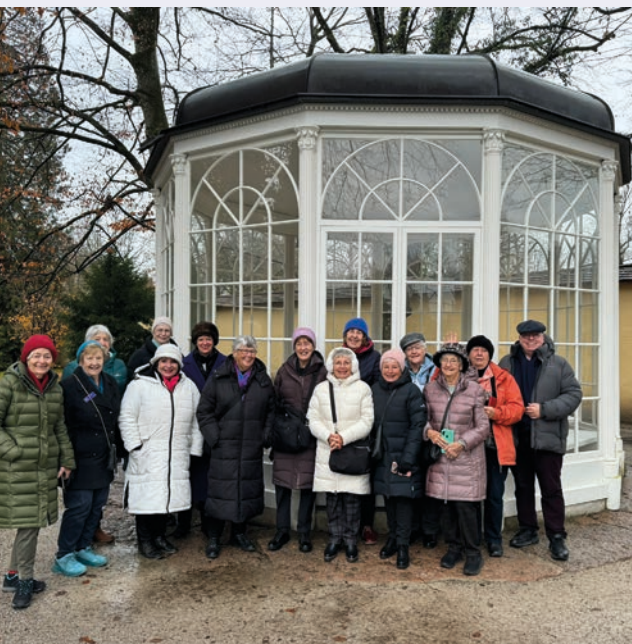
SOUND OF MUSIC TOUR