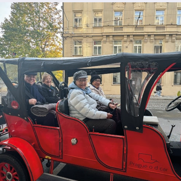
VINTAGE CAR TOUR PRAGUE