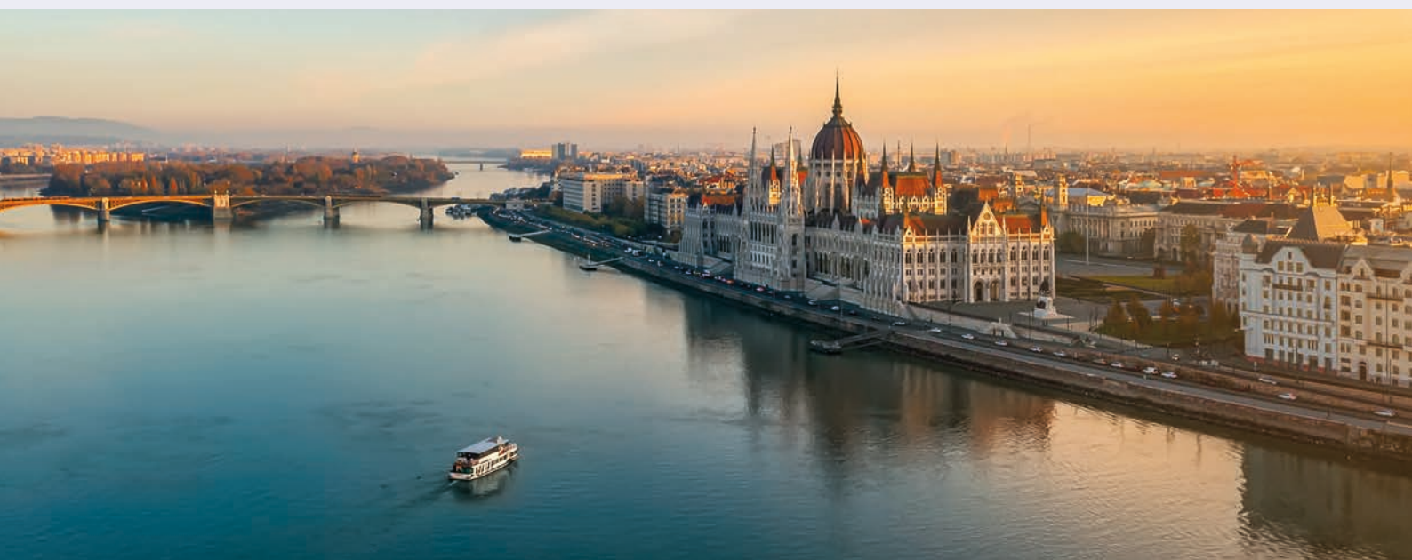
CRUISE ALONG THE DANUBE