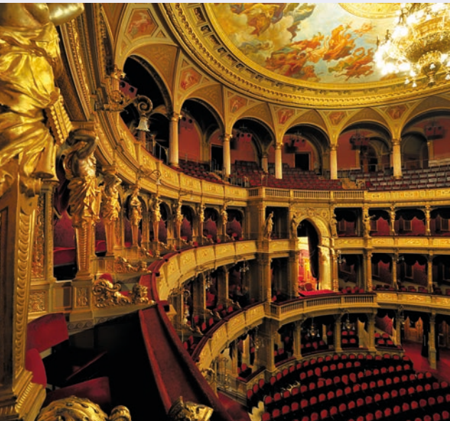
HUNGARIAN STATE OPERA HOUSE