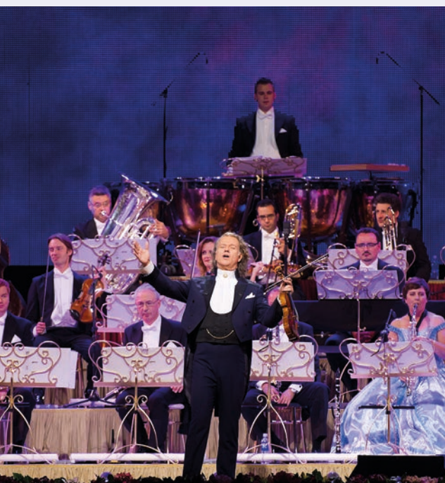
CHRISTMAS WITH ANDRÉ RIEU