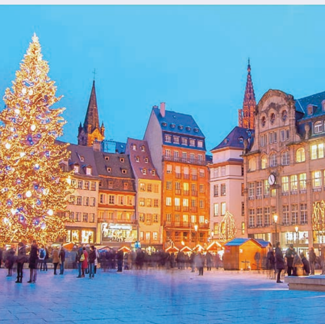
CHRISTMAS MARKET IN STRASBOURG