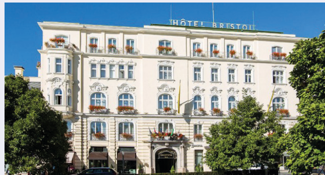
HOTEL BRISTOL, SALZBURG