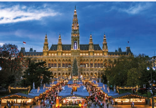
VIENNA CHRISTMAS MARKETS