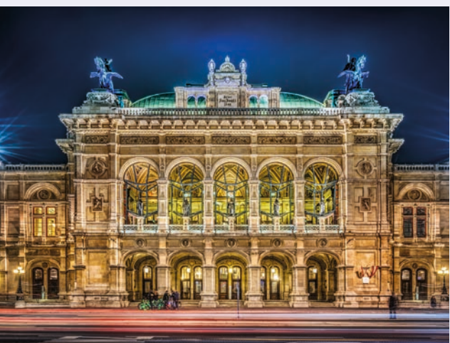
VIENNA OPERA HOUSE