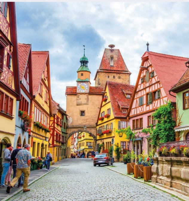
THE BEAUTIFUL TOWN OF ROTHENBURG