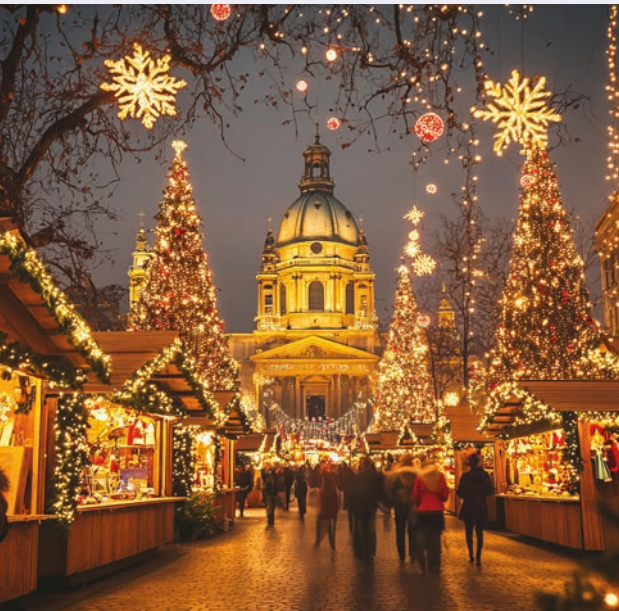
CHRISTMAS IN BUDAPEST