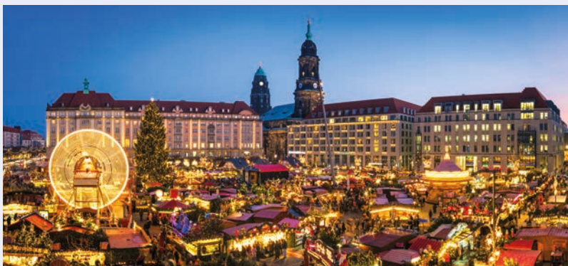
DRESDEN CHRISTMAS MARKETS