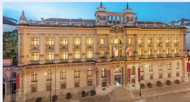
CARLO IV DEDICA ANTHOLOGY HOTEL