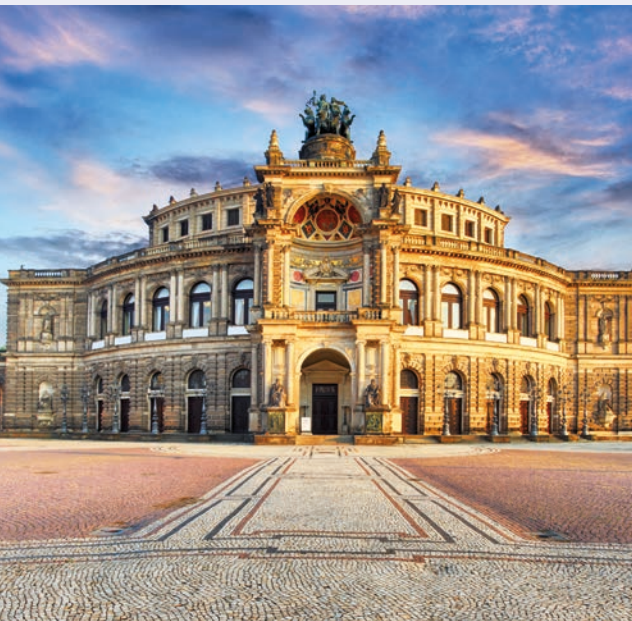
SEMPER OPERA, DRESDEN