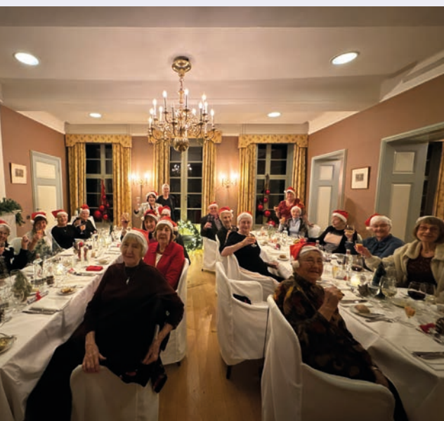
OUR FINAL DINNER