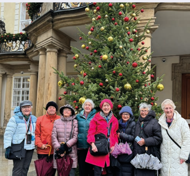
ENJOY THE CHRISTMAS FUN