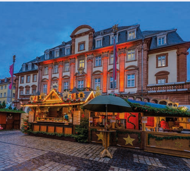
CHRISTMAS MARKETS IN HEIDELBERG