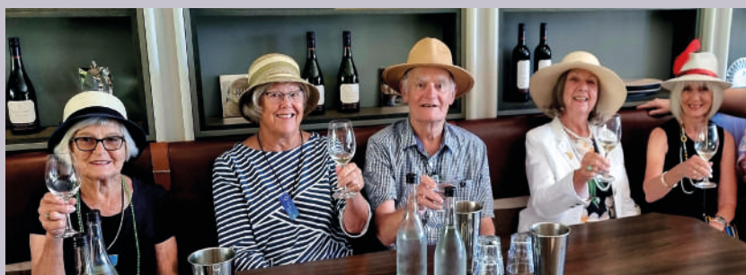
WINE TASTING AT CRAGGY RANGE

This morning we have breakfast at the hotel before making our way to the airport for our flights home around New Zealand, full of wine, food and fantastic memories of our Art Deco Weekend.