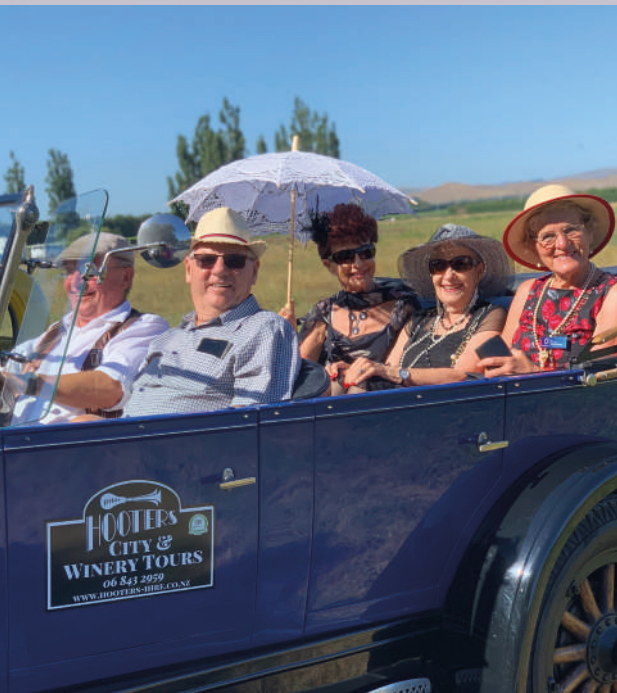
VINTAGE CAR TOUR