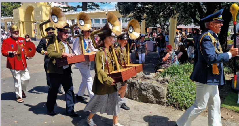
ART DECO FESTIVAL