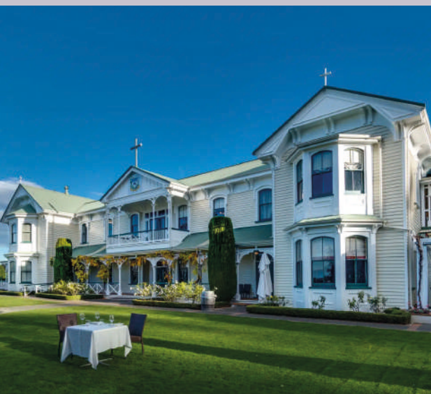
MISSION ESTATE WINERY