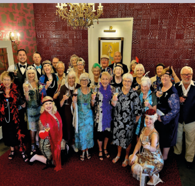
DRESS UP IN STYLE