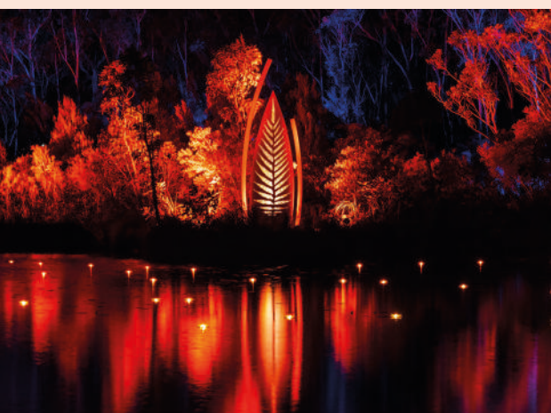
ILLUMINA RETURN TO SKY LIGHT SHOW