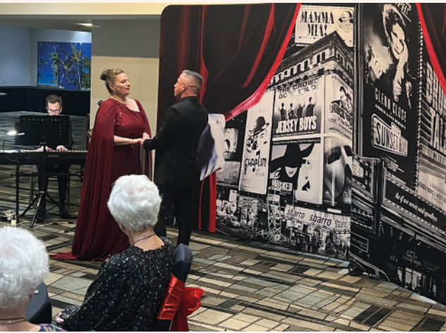
A CELEBRATION OF LOVE SONGS!