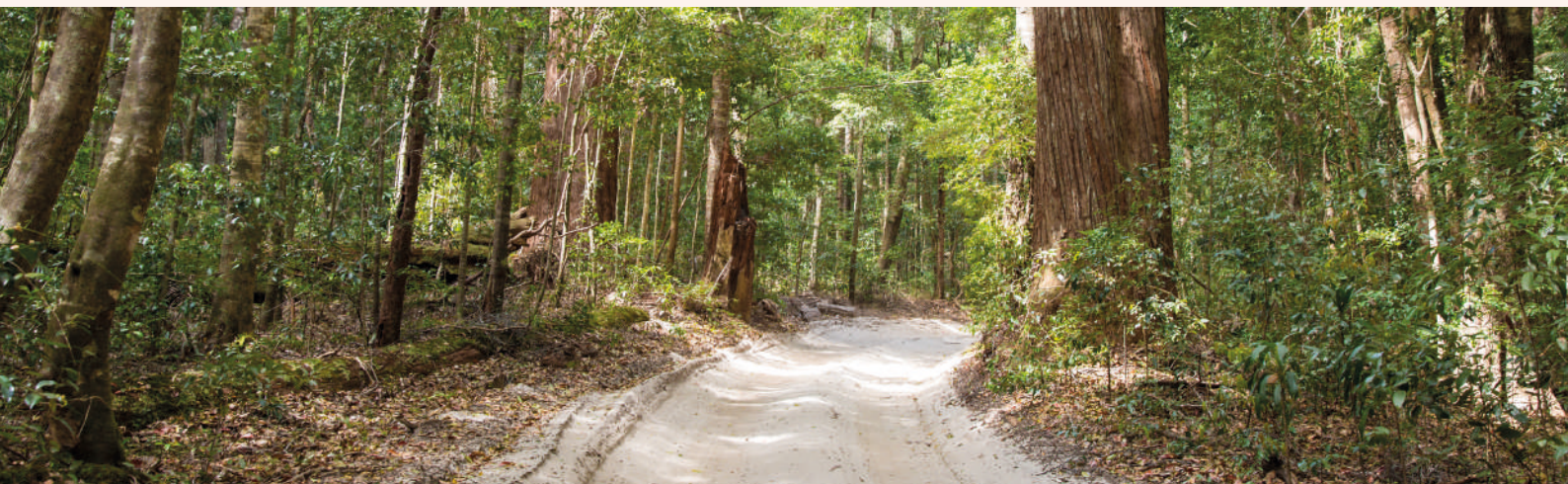
EXPLORE THE BEAUTIFUL SCENERY