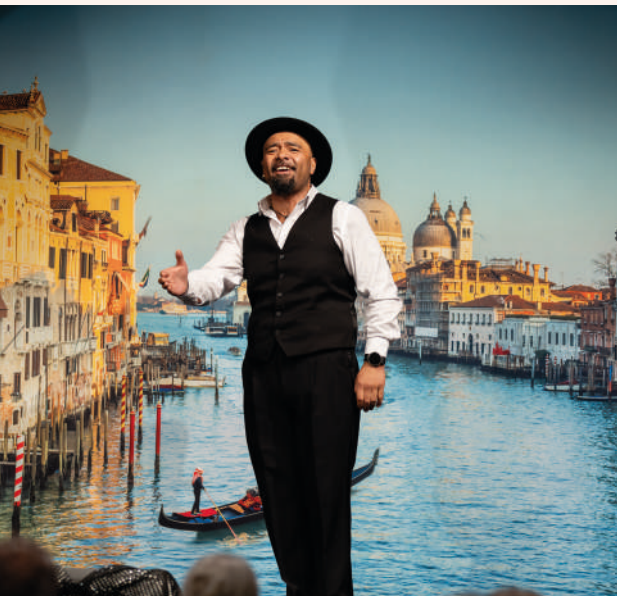
CELEBRATE FAMOUS ITALIAN SONGS