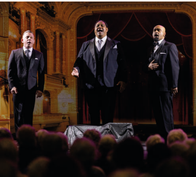
OUR CONCERT, A TRIBUTE TO MARIO LANZA