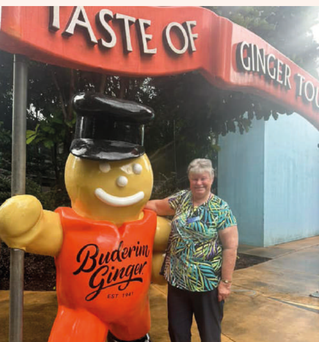
THE TASTE OF GINGER TOUR