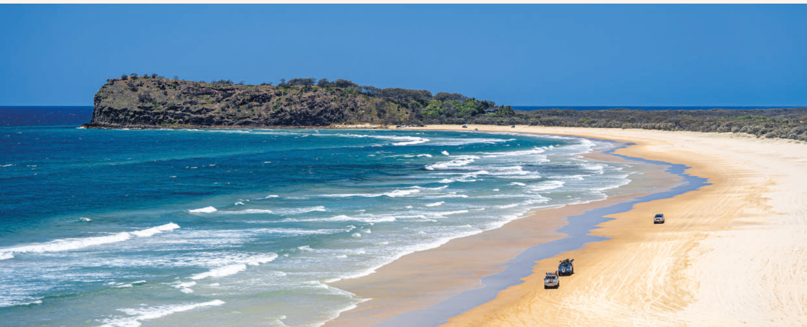
DRIVE THROUGH THE BEAUTY SPOTS OF FRASER ISLAND