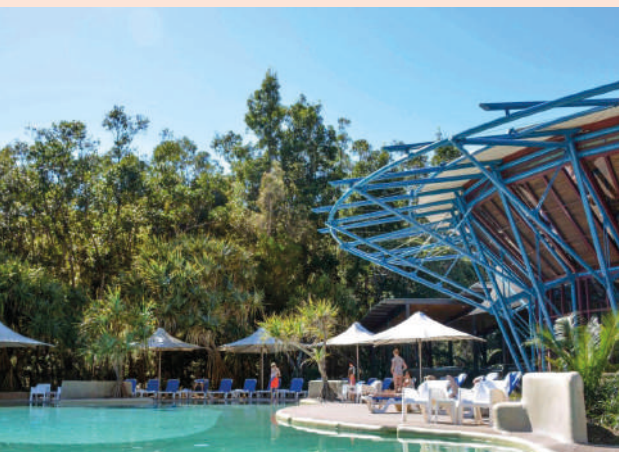
KINGFISHER BAY RESORT