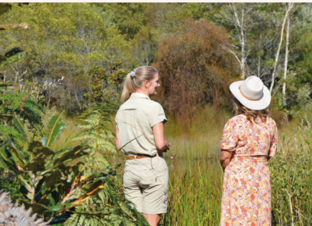
ENJOY A GUIDED TOUR