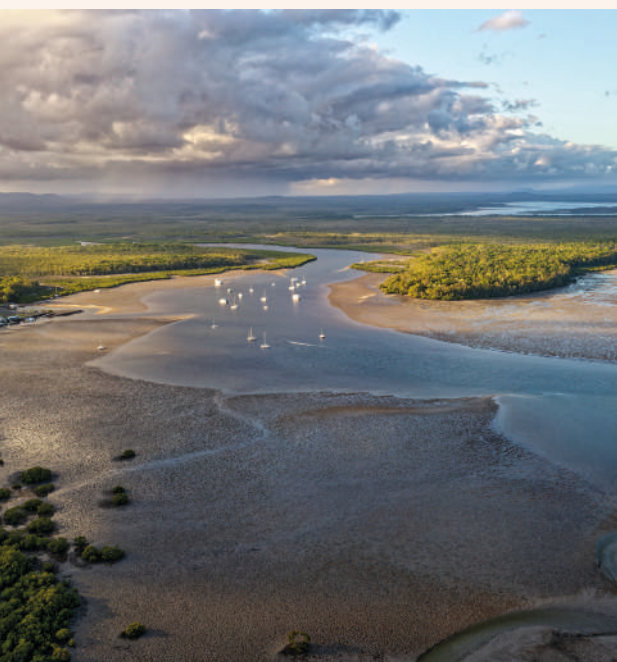
GREAT SANDY STRAITS