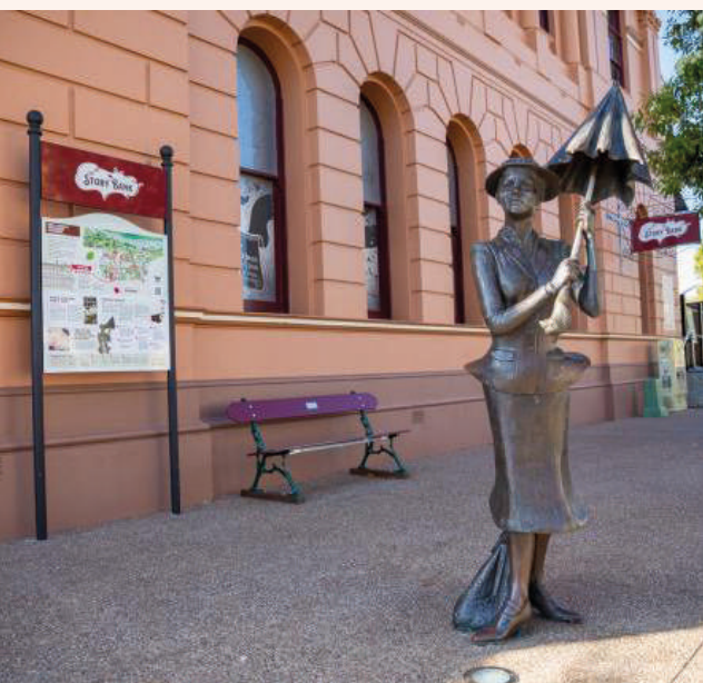
HOME OF BELOVED MARY POPPINS