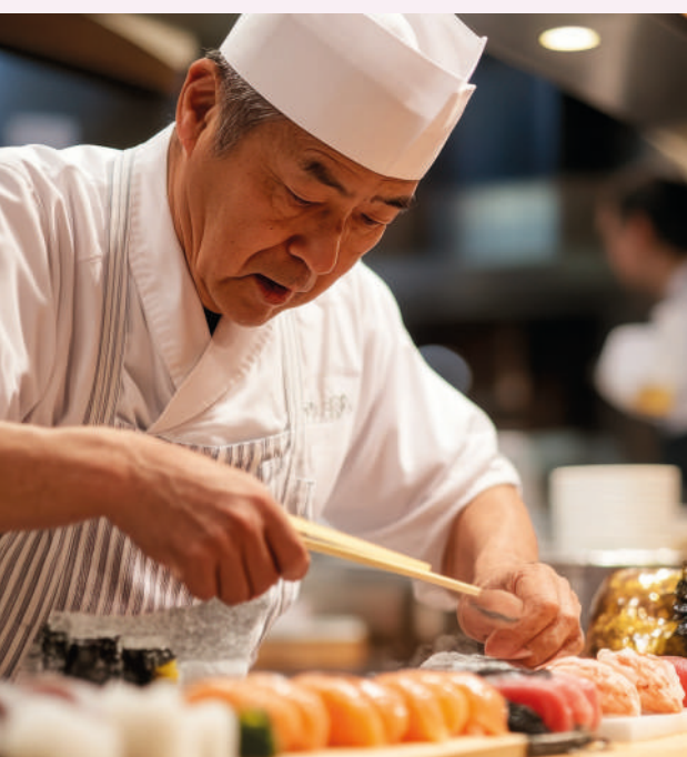
SUSHI MAKING CLASS