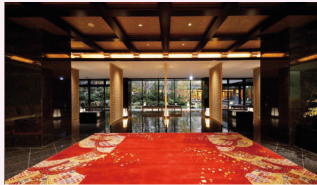
HOTEL SANRAKU, KANAZAWA