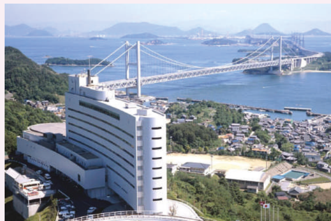
SETOUCHI KOJIMA HOTEL, KURASHIKI

Transport: In Japan we travel by coach within the cities and shorter distances in the countryside and often by Shinkansen (bullet trains) between cities. We have First Class reserved seats on the bullet trains. Over the past half century, the made-in-Japan technology behind these sleek trains has continued to evolve. Top speed has risen from 210 km/h (130 mph) to 320 km/h (200 mph), and ridership is now 1 million passengers per day.