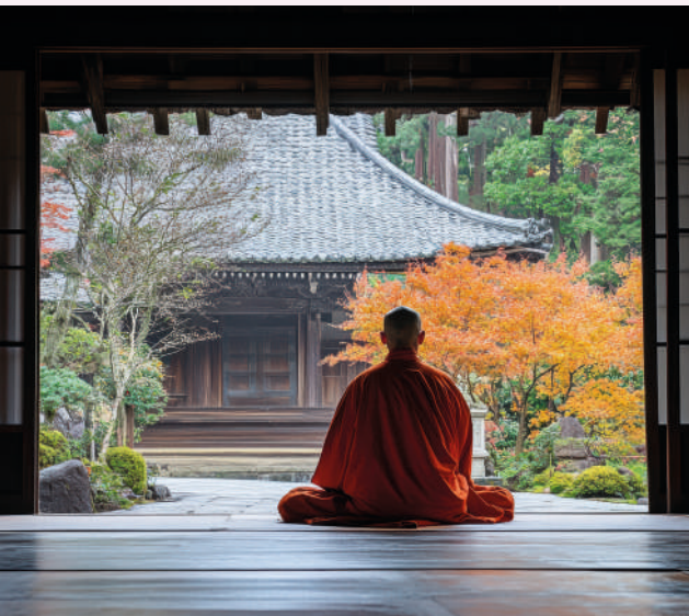
EXPERIENCE SILENCE WITH MONKS AT MT KOYA