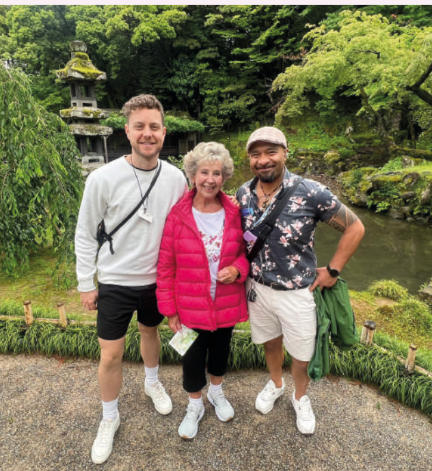
VISIT THE GARDENS WITH OUR GREAT HOSTS