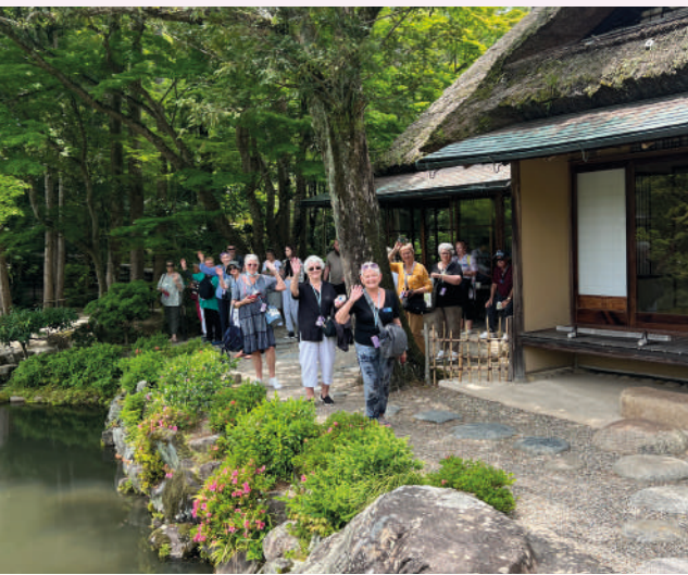
OUR TOUR ENDS WITH FABULOUS FRIENDS