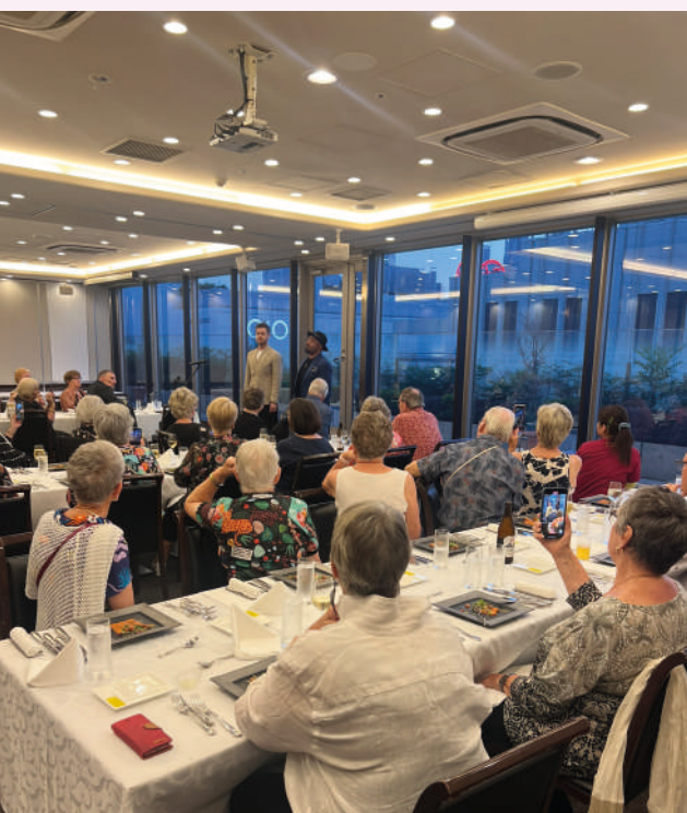
FAREWELL CONCERT FROM OUR ARTISTS