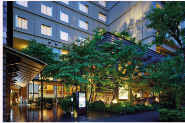
HOTEL NIWA, TOKYO