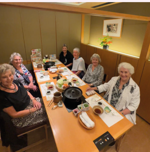
ENJOY A HOT POT DINNER