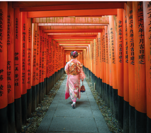
FUSHIMI INARI SHRINE