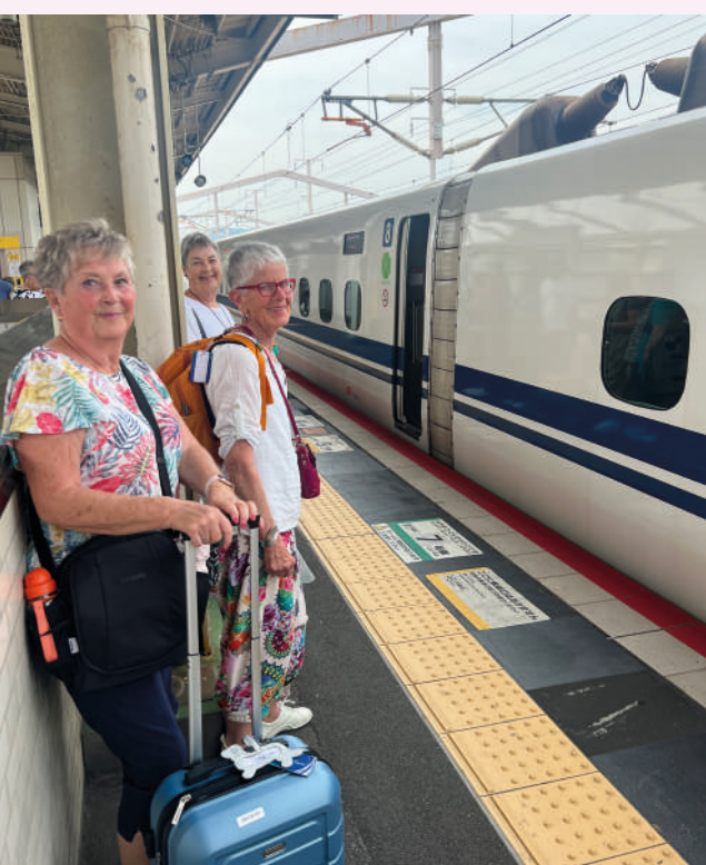
OFF ON THE BULLET TRAIN!