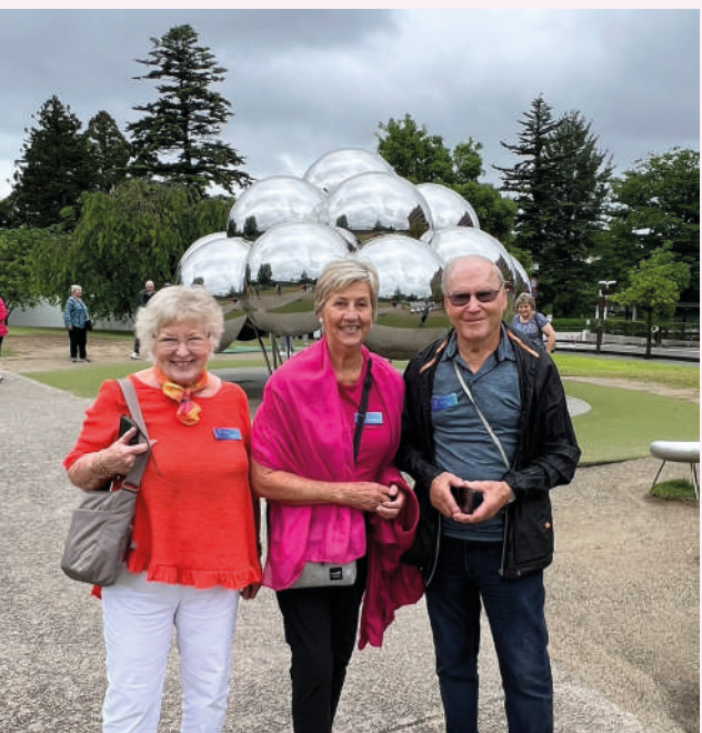
CONTEMPORARY ART ON NAOSHIMA