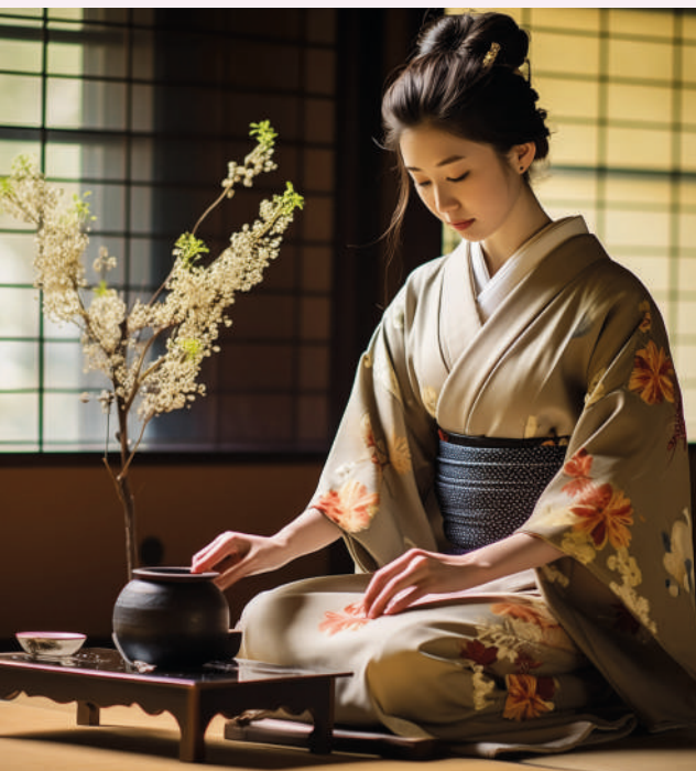
TEA MAKING CEREMONY