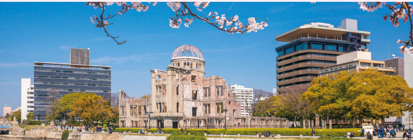
HIROSHIMA PEACE MEMORIAL