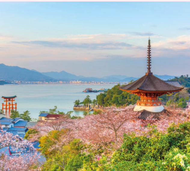
MIYAJIMA ISLAND, HIROSHIMA