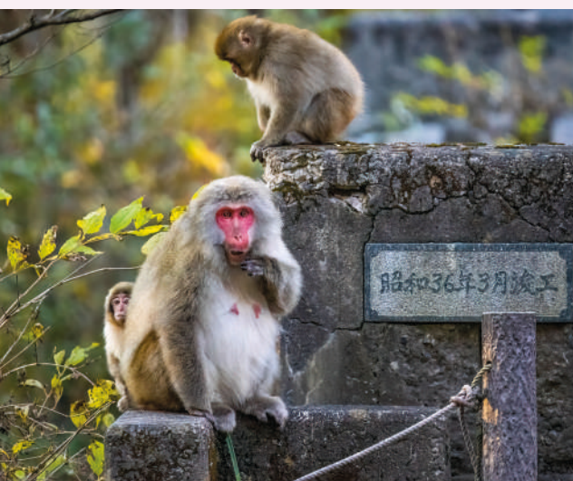
VISIT THE FAMOUS SNOW MONKEYS