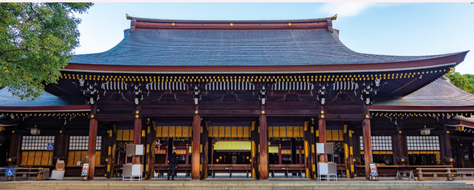
MEIJI JINGU SHRINE