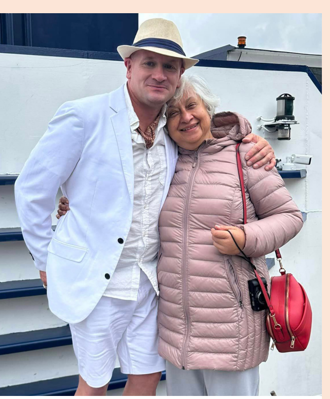
PROVIDING LOVE AND LAUGHS