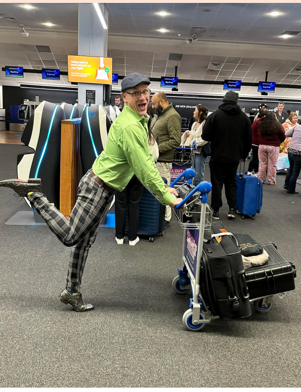
WE'RE OFF TO NEW YORK!