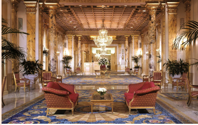
FAIRMONT COPLEY PLAZA