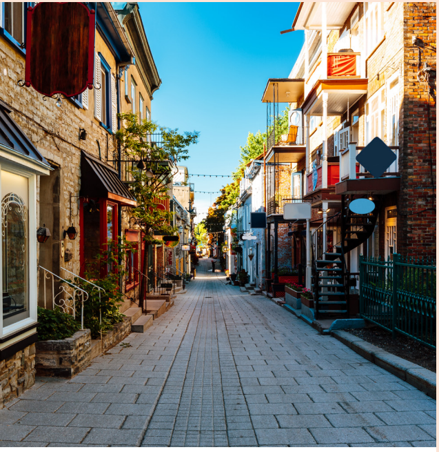
EXPERIENCE THE CHARM OF QUEBEC