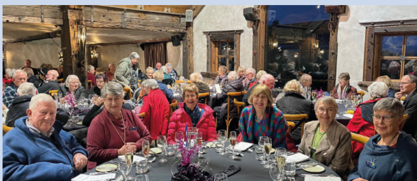
ENJOY A FABULOUS DINNER