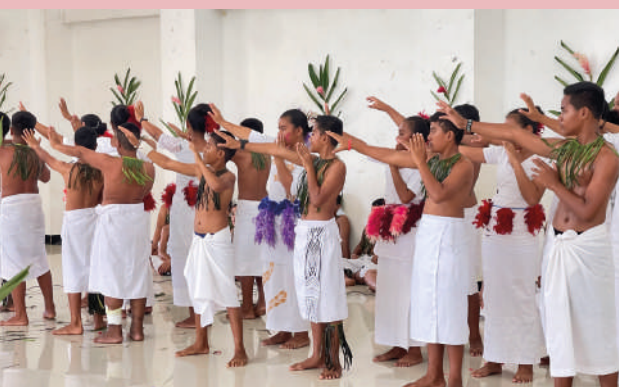
ENJOY A SHOW FROM LOCAL SCHOOL CHILDREN!