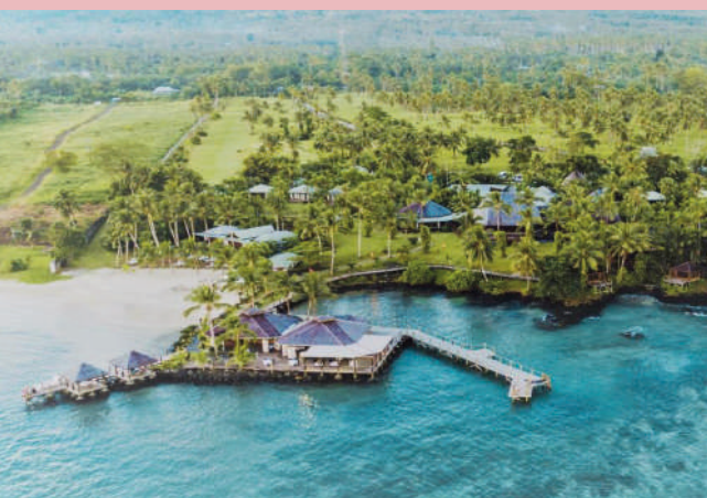
SINALEI REEF RESORT AND SPA