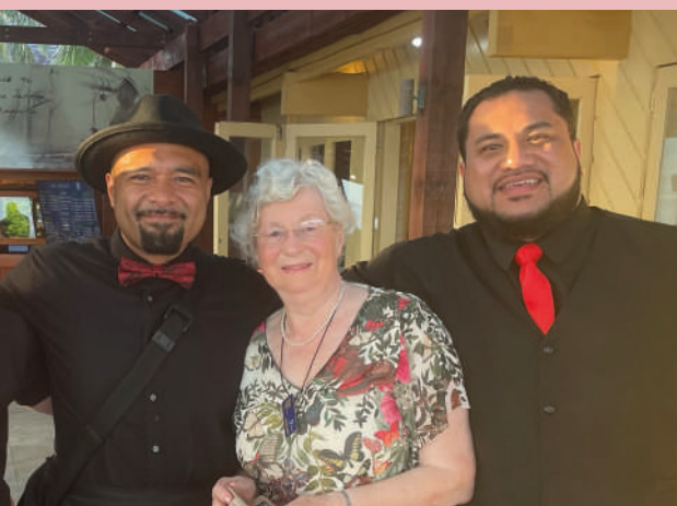
OUR FABULOUS ARTISTS