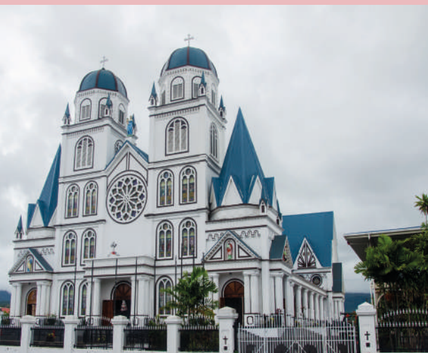
CATHOLIC CATHEDRAL, APIA