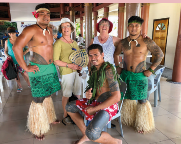
MEETING THE LOCALS