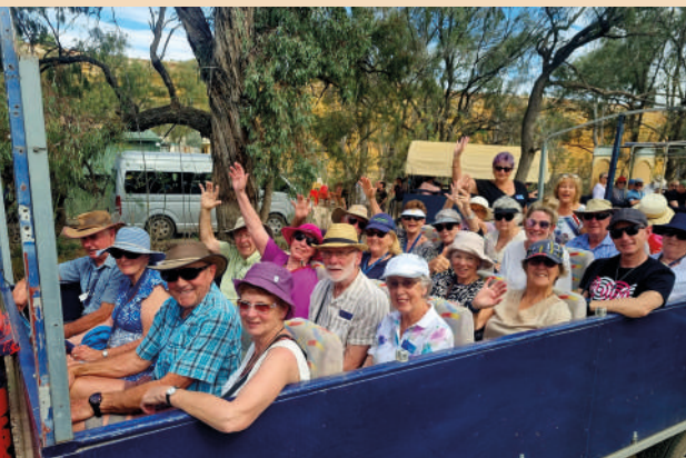
EXPLORING THE AUSTRALIAN COUNTRY SIDE