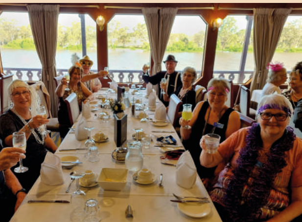
DRESS TO IMPRESS