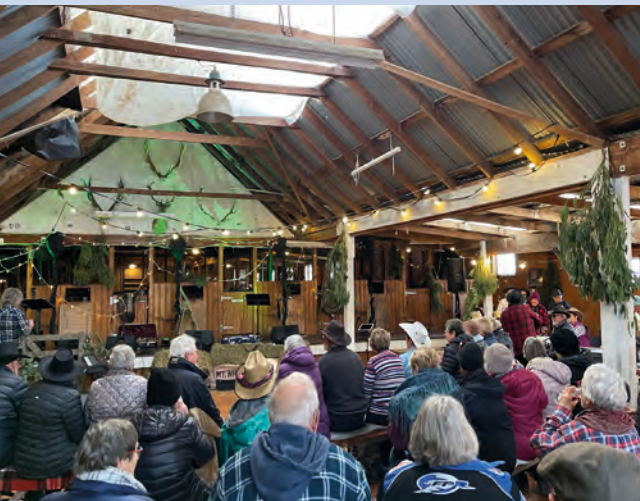
OUR FANTASTIC EVENT - WARBLING IN THE WOOLSHED