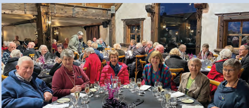
ENJOY A FABULOUS DINNER