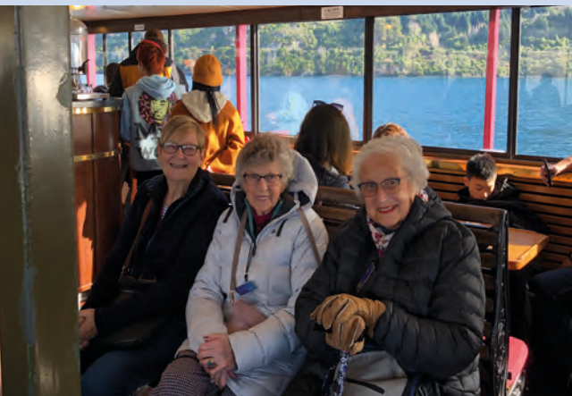
CRUISING ON LAKE WAKATIPU