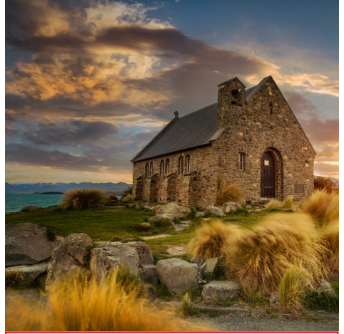
Church of the Good Shepherd