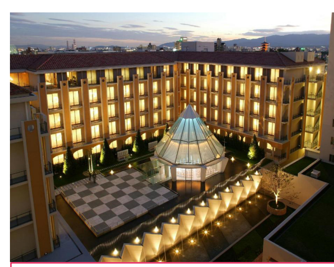
Hotel Granvia Hiroshima