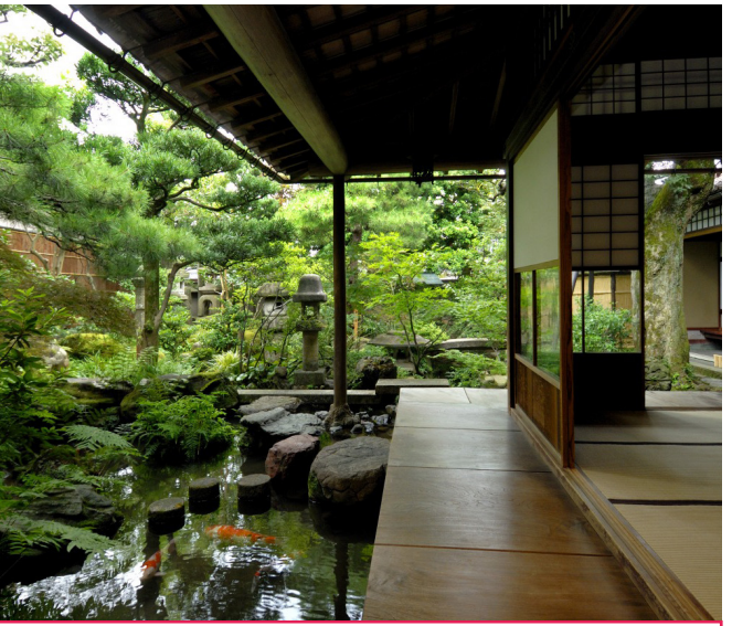
Nomura Samurai House