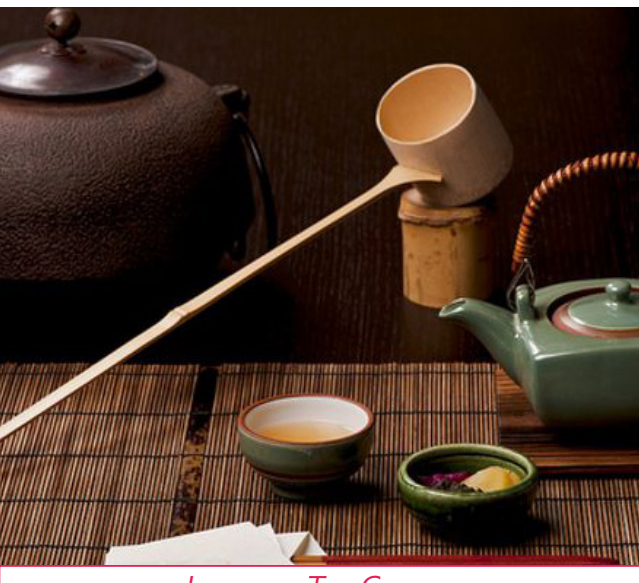
lapanese Tea Ceremony