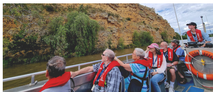
Scenic Boat Ride