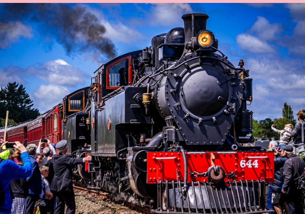
GLENBROOK VINTAGE RAILWAY