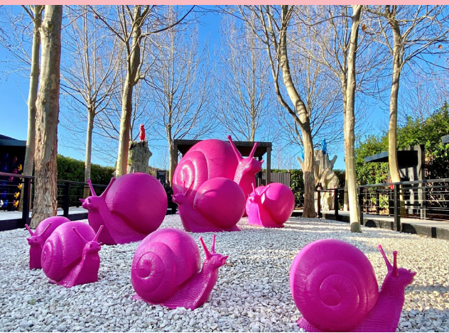
THE SCULPTUREM EXPERIENCE