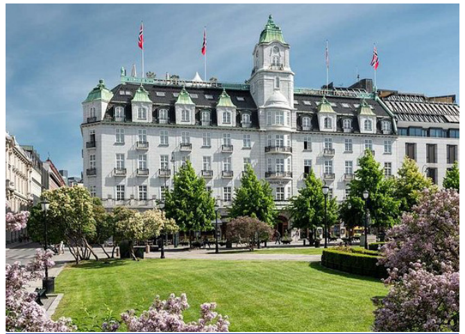
Grand Oslo Hotel, Oslo