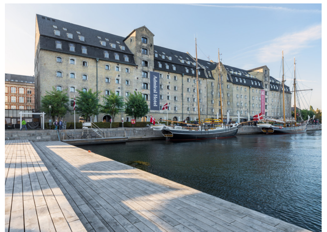
Copenhagen Admiral Hotel