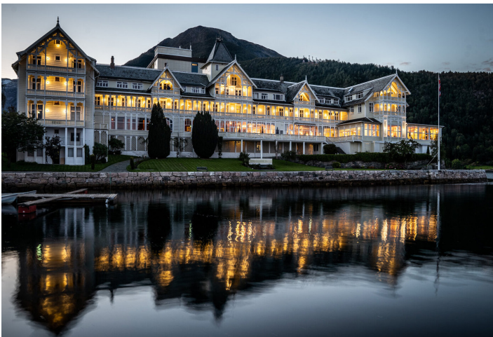
The Kviknes Hotel, Balestrand