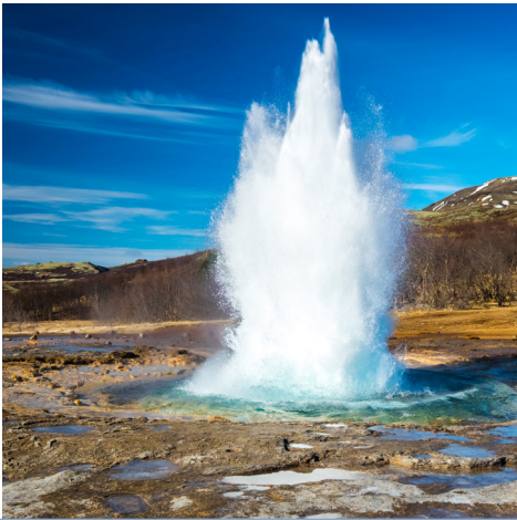
Golden Circle Iceland