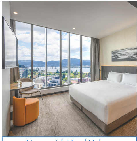
Movenpick Hotel Hobart