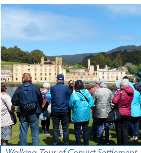
Walking Tour of Convict Settlement

• Explore as you wish before departing the historic site to tour beside Norfolk and Frederick Henry Bays back to Hobart.