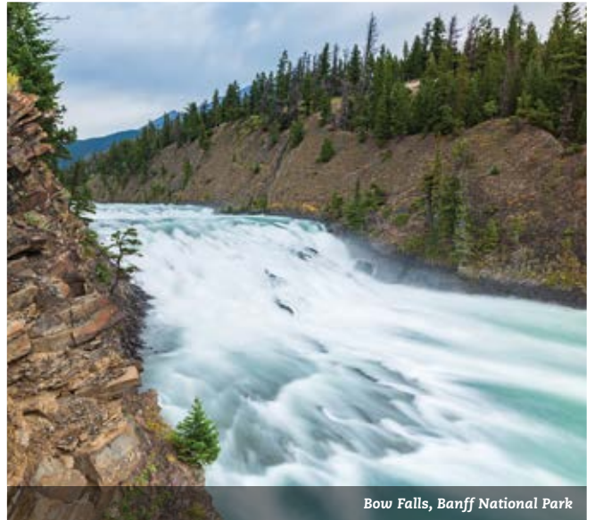
Bow Falls, Banff National Park