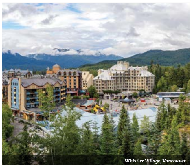
Whistler Village, Vancouver