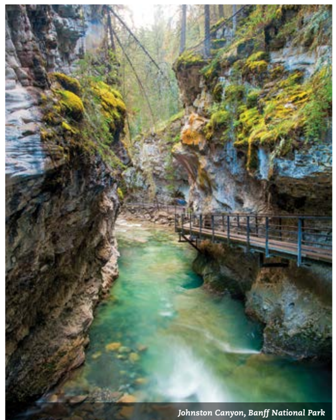
Johnston Canyon, Banff National Park