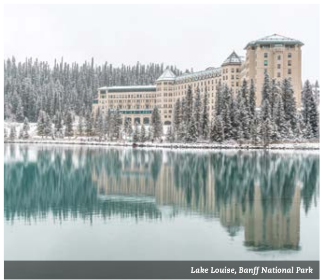
Lake Louise, Banff National Park