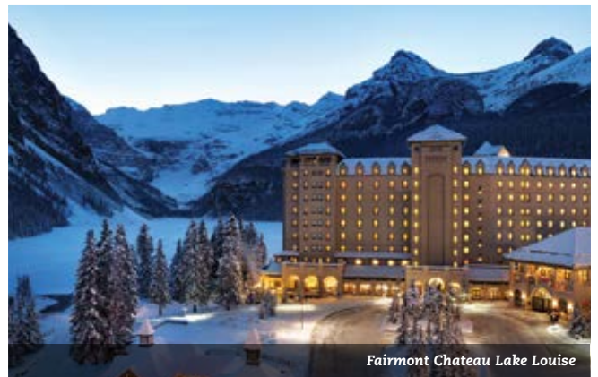
Fairmont Chateau Lake Louise