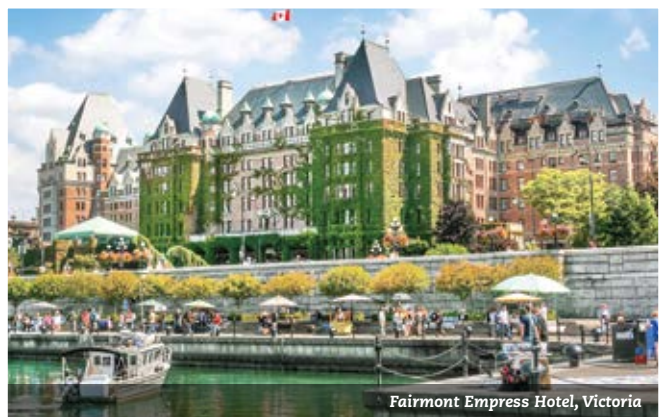
Fairmont Empress Hotel, Victoria