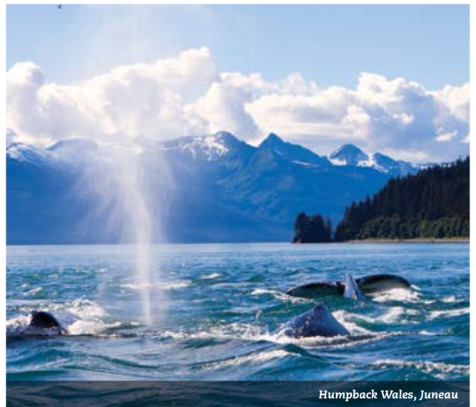
Humpback Whales, Juneau