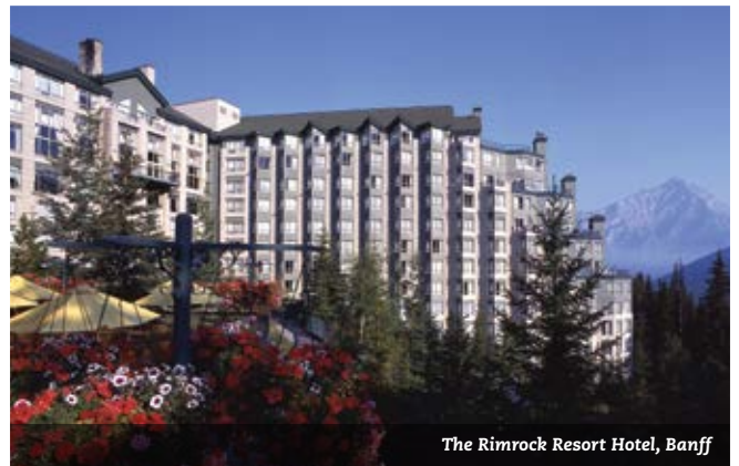
The Rimrock Resort Hotel, Banff

Fairmont Empress Hotel, Victoria. We will spend our final night here in this award winning hotel, honoured with the Travel + Leisure distinction as a top Canadian hotel. The Fairmont Empress graces Victoria's sparkling inner harbour with an iconic presence with its distinctive French chateau style.