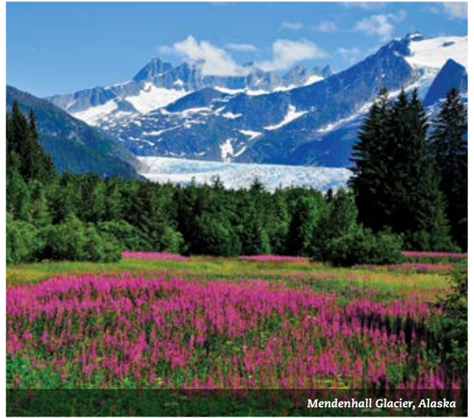
Mendenhall Glacier, Alaska

Journey down the west side of White Pass Canyon and the Tormented Valley and Pitchfork Falls en route.