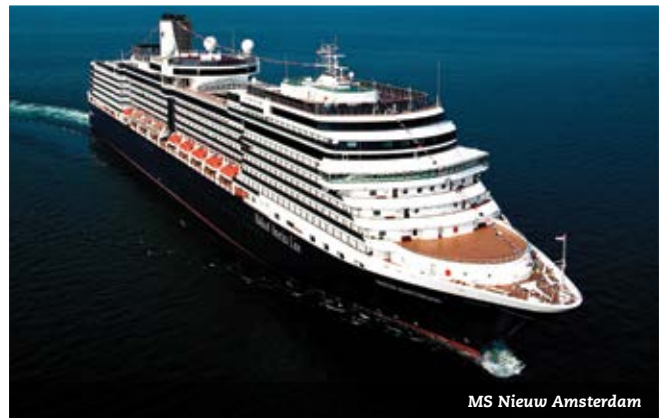
MS Nieuw Amsterdam