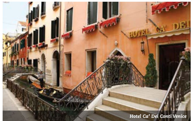
Hotel Ca' Dei Conti Venice