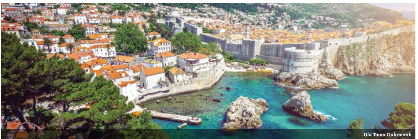
Old Town Dubrovnik