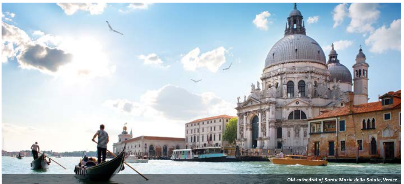
Old cathedral of Santa Maria della Salute, Venice