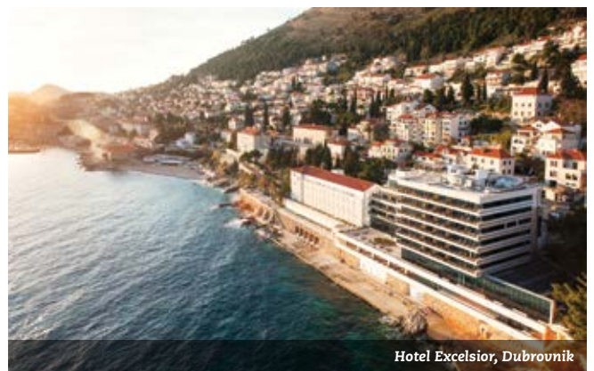
Hotel Excelsior, Dubrovnik