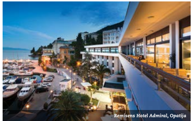
Remisens Hotel Admiral, Opatija