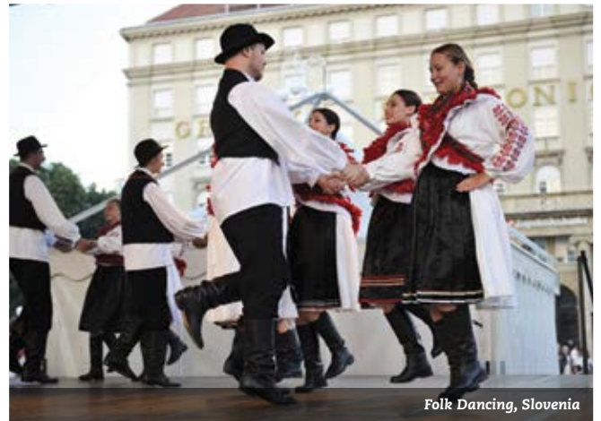
Folk Dancing, Slovenia