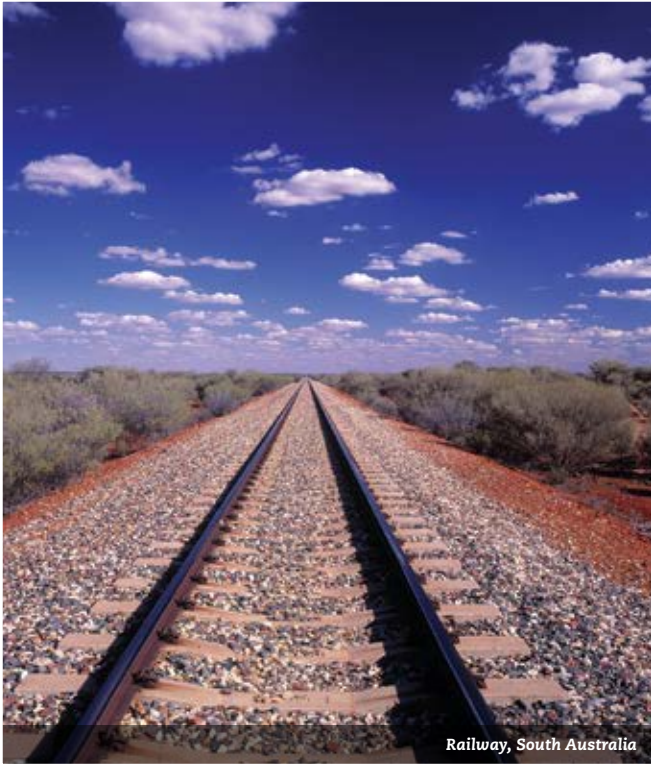
Railway, South Australia