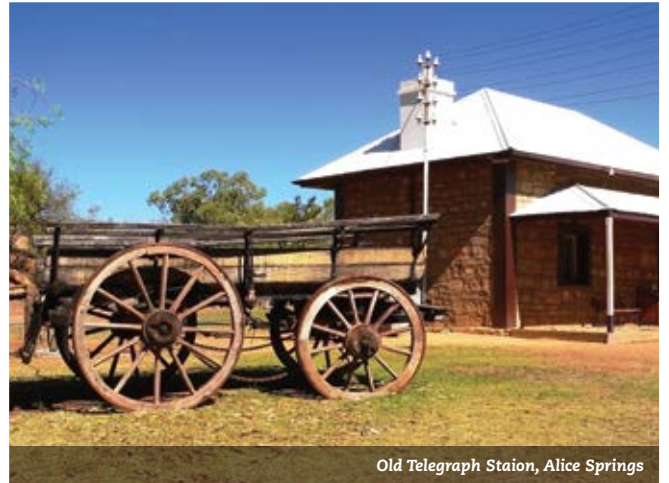
Old Telegraph Station, Alice Springs

Today we fly home after a quick stop over in Sydney for the night.