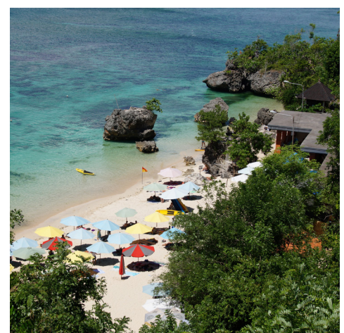
Padang Padang Beach