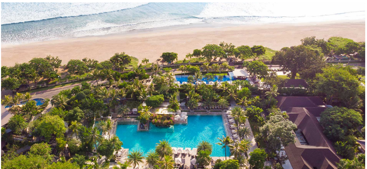
Padma Resort Legian