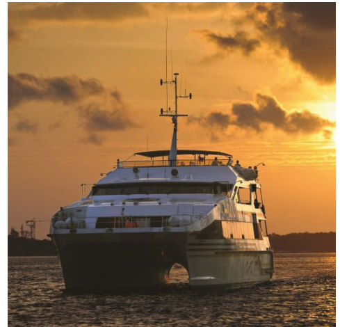
Sunset Dinner Cruise

Arrive home after 10 days of fun and fabulous music, having visited one of the most beautiful countries in the world!