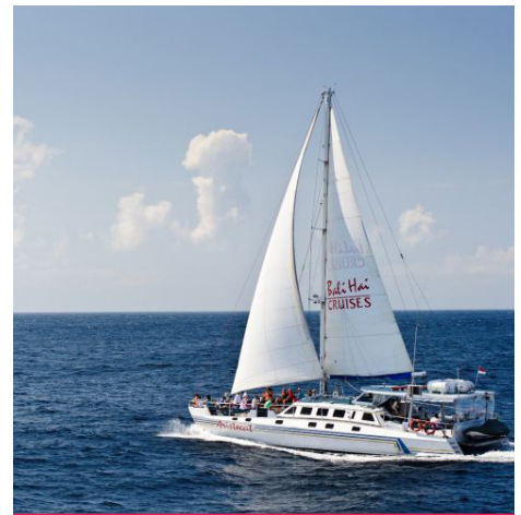
Aristocat Luxury Catamaran