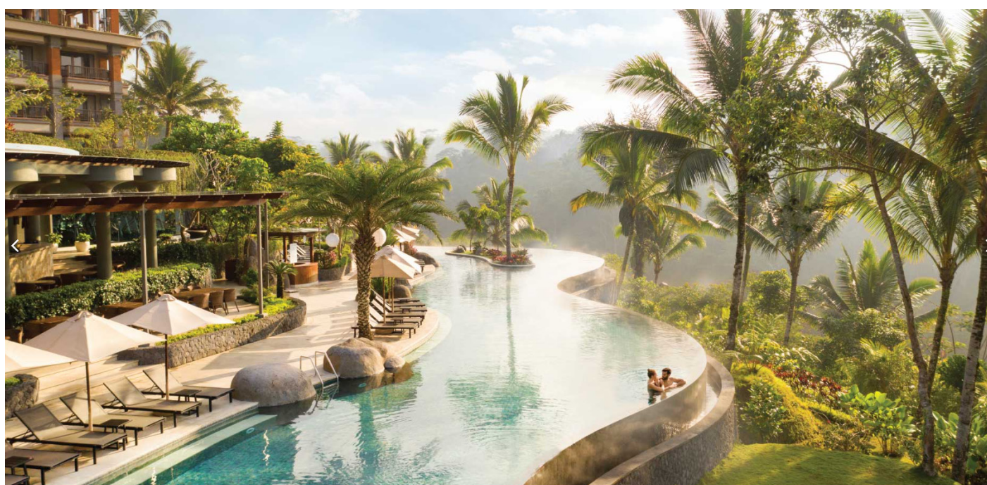
Padma Resort Ubud