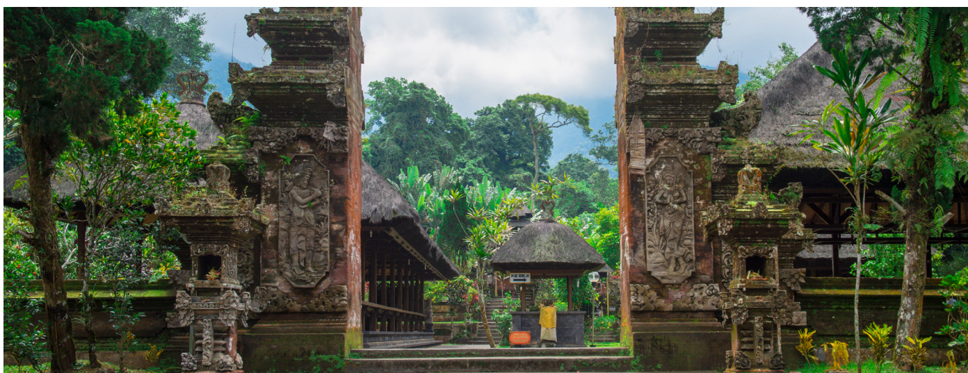
Pura Luhur Batukaru Temple