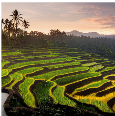
Jatiluwih Rice Terraces