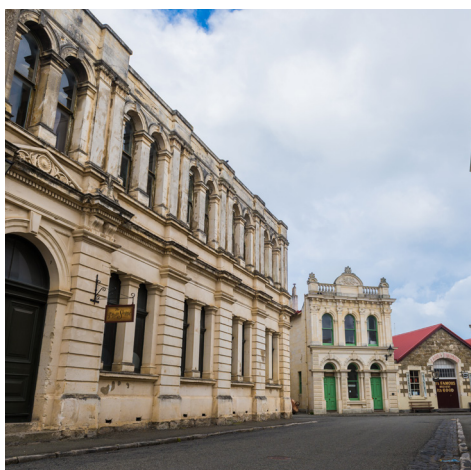
Oamaru Historic Precinct