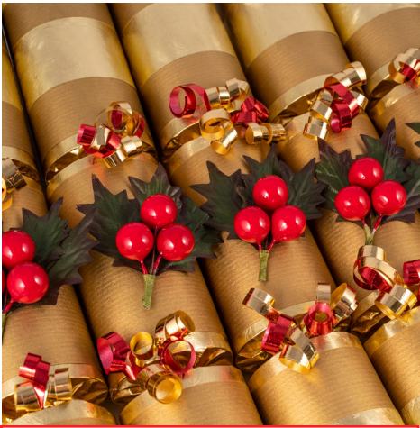
Special Christmas Surprises