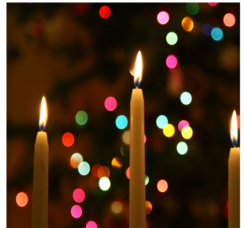
Carols by Candlelight