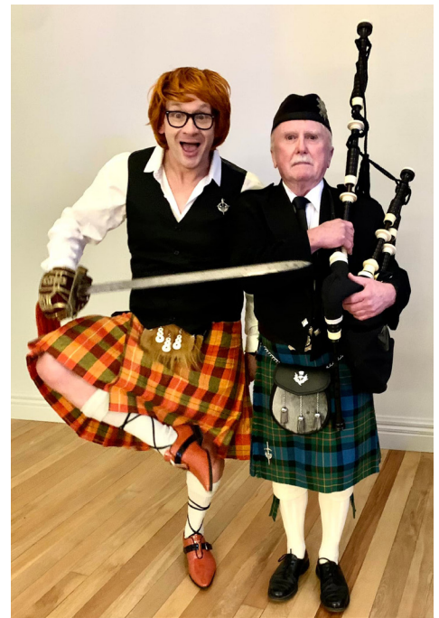
A Scottish New Years Eve