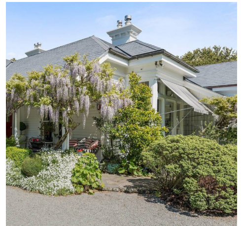
Kate Sheppard House