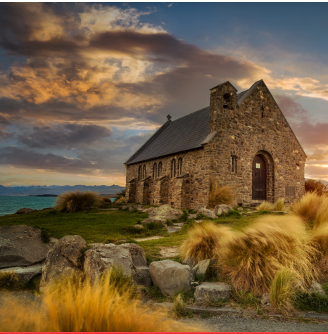
Church of the Good Shepherd