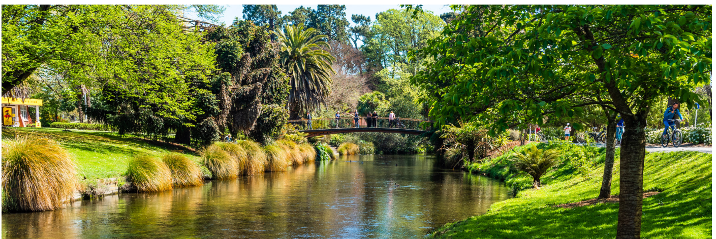
Avon River, Christchurch