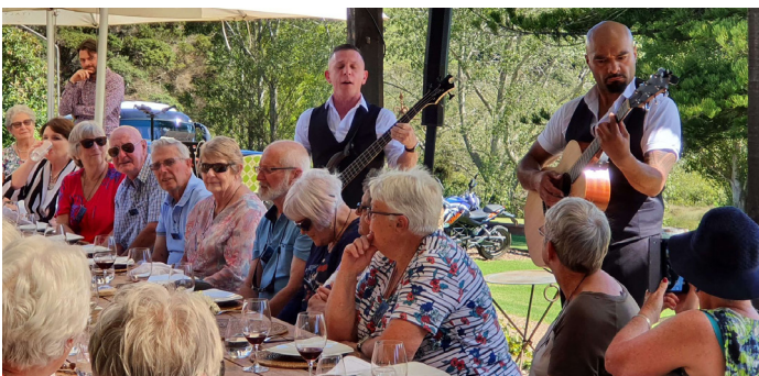
Italian Long Lunch with music from our Tenors