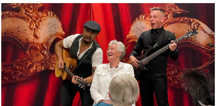
Serenade by our Tenors

After breakfast we are transferred to the International Airport for our flight home. Tanned, ears ringing with beautiful music, tummies full of French food and cameras packed with photos we depart for home.