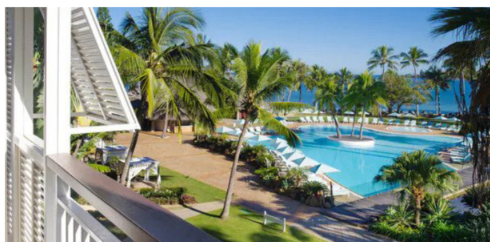
Le Méridien Noumea Resort & Spa