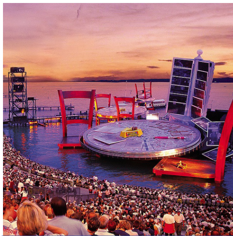
Bregenz Opera Festival