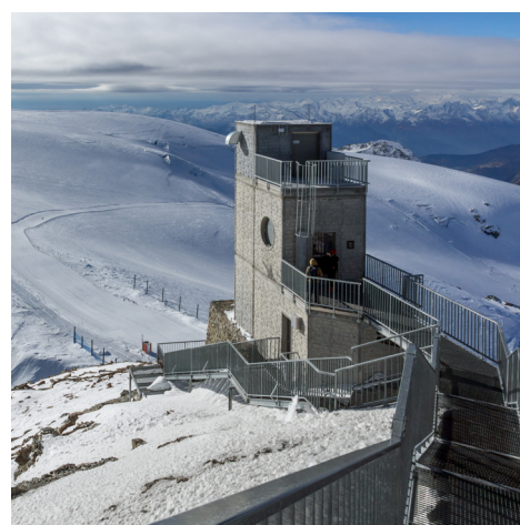
Matterhorn Glacier Paradise