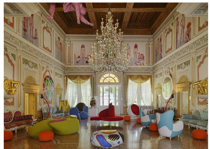
Byblos Art Hotel Villa Amista, Verona