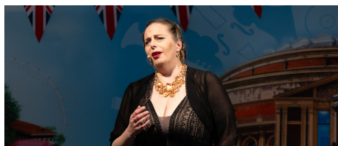
Entertainment from your host