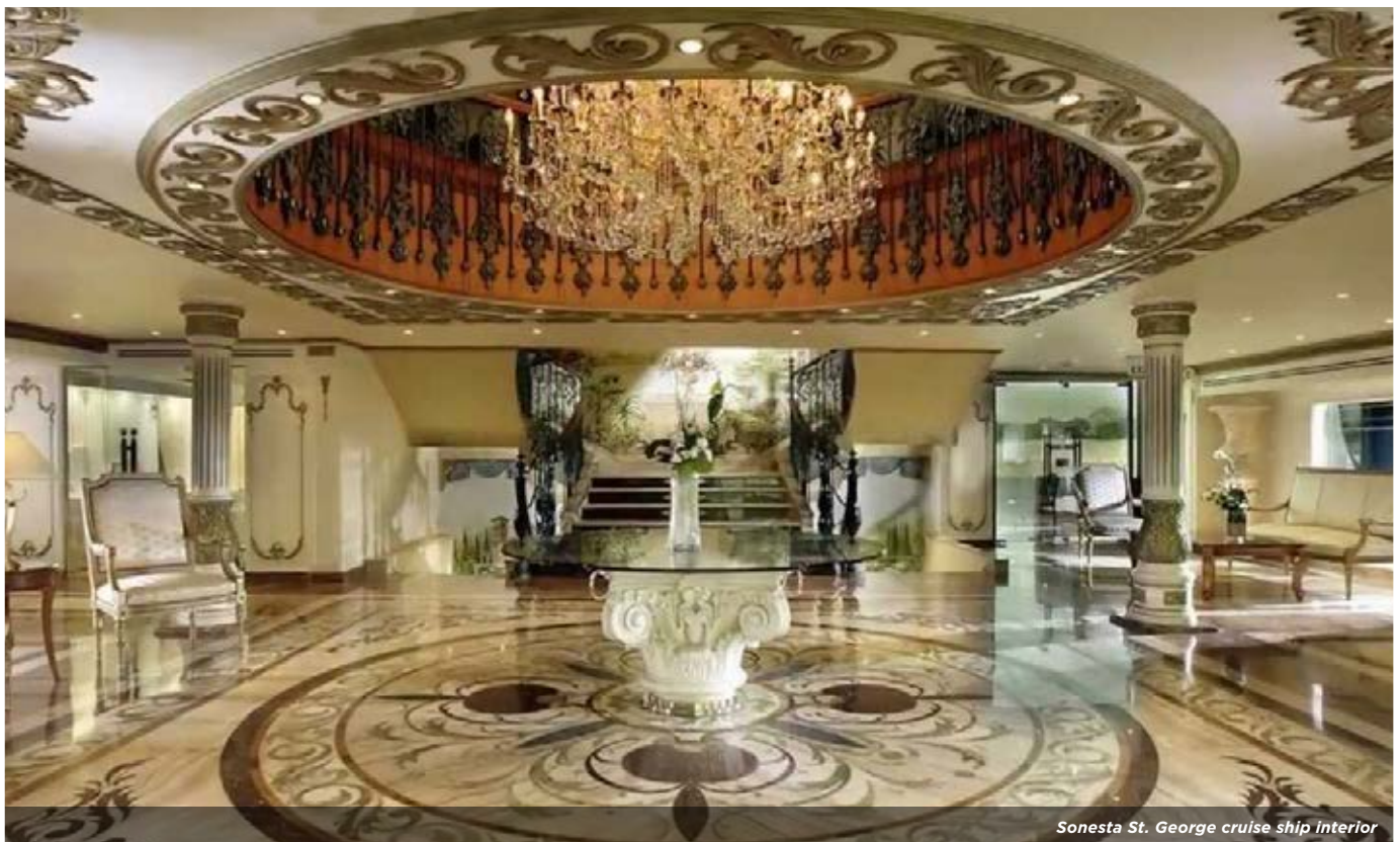
Sonesta St. George cruise ship interior