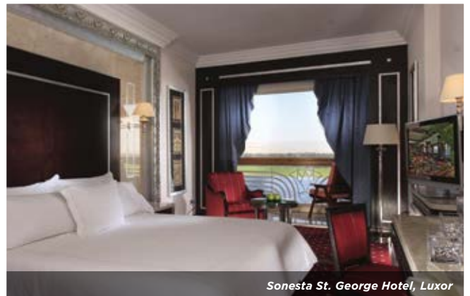
Sonesta St. George Hotel, Luxor