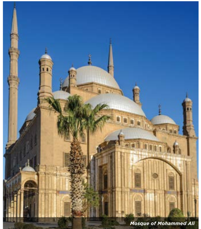
Mosque of Mohammed Ali