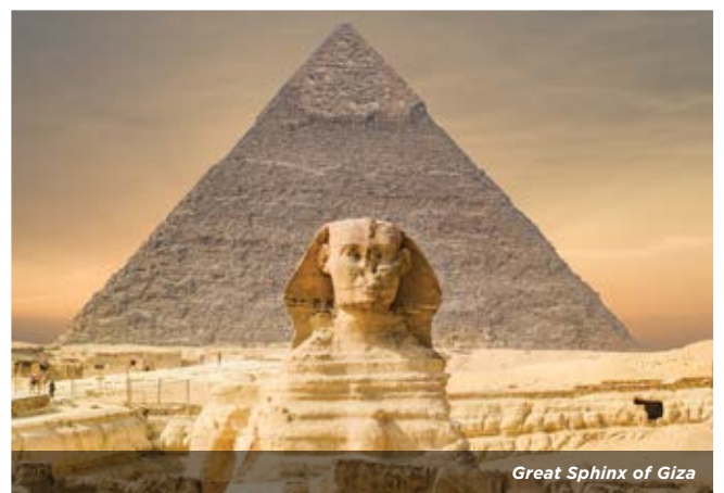
Great Sphinx of Giza