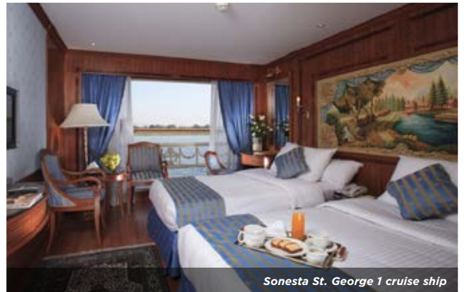
Sonesta St. George 1 cruise ship