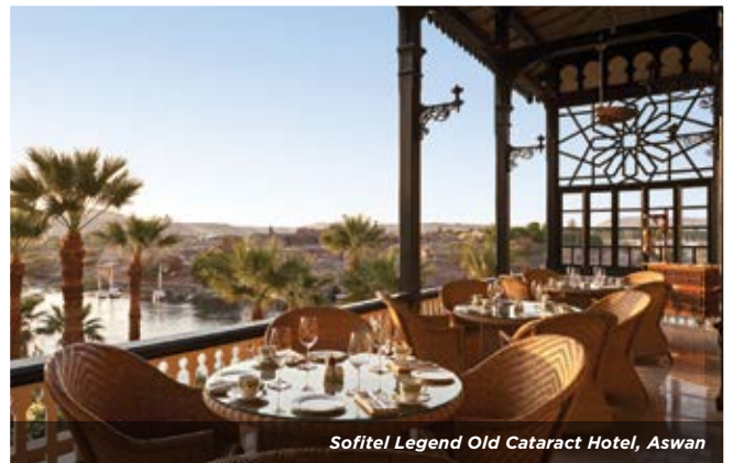
Sofitel Legend Old Cataract Hotel, Aswan