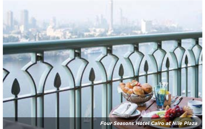
Four Seasons Hotel Cairo at Nile Plaza

Situated on the banks of the Nile and close to the Luxor Temples, the Sonesta Hotel Luxor has a history of hosting royalty and celebrities throughout the years. The interior features grand staircases, high ceilings and lounge areas that are appointed with antique furniture, as well as a magnificent pool with sweeping views of the Nile beside us.