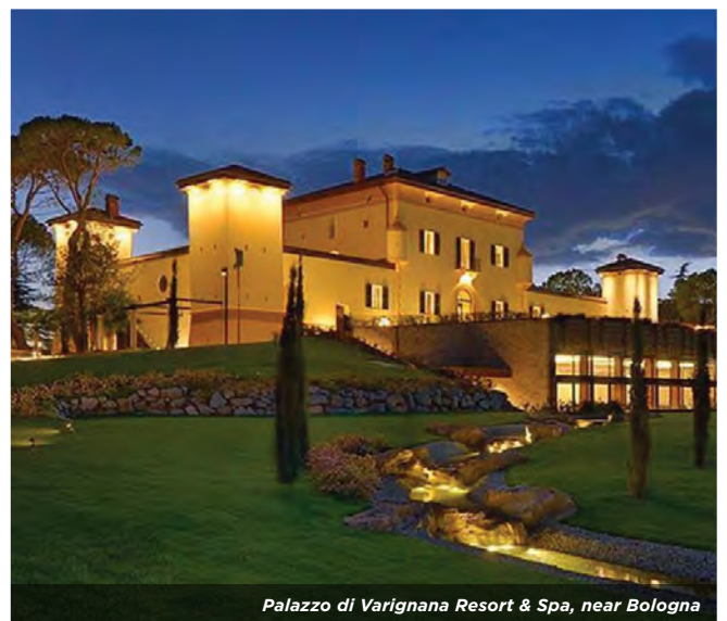
Palazzo di Varignana Resort & Spa, near Bologna