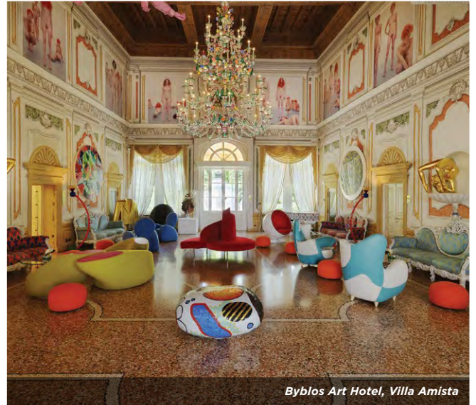
Byblos Art Hotel, Villa Amista

Grand Hotel de la Ville, Parma (7 nights) is the only 5-star hotel in Parma and is within walking distance of the historic centre and all the sights of the city, located in the exclusive Barilla Centre.