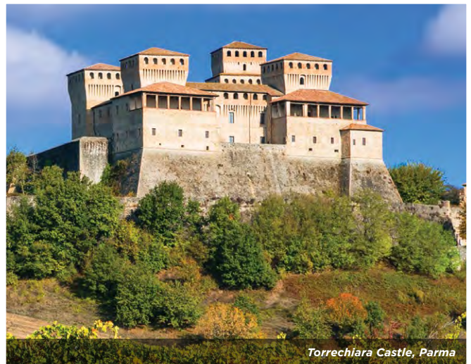
Torrechiara Castle, Parma