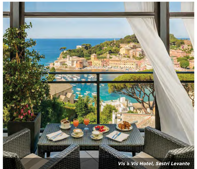
Vis à Vis Hotel, Sestri Levante