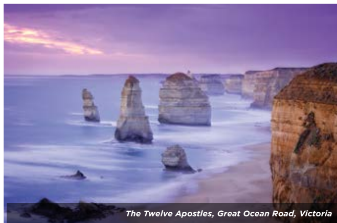
The Twelve Apostles, Great Ocean Road, Victoria