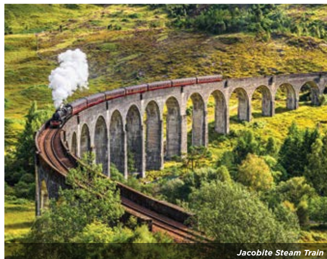
Jacobite Steam Train