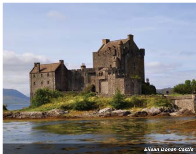
Eilean Donan Castle