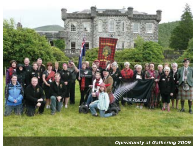
Operatunity at Gathering 2009