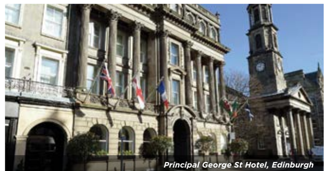
Principal George St Hotel, Edinburgh