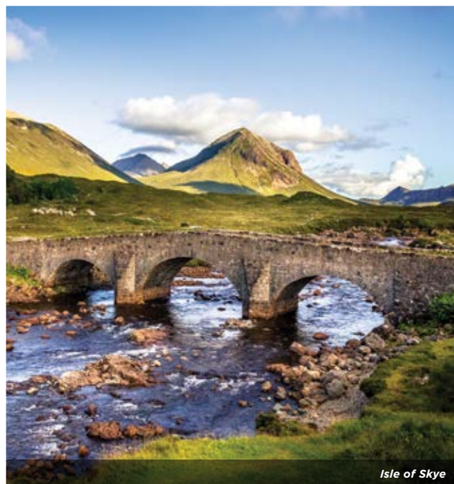
Isle of Skye