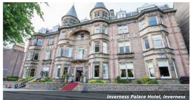
Inverness Palace Hotel, Inverness