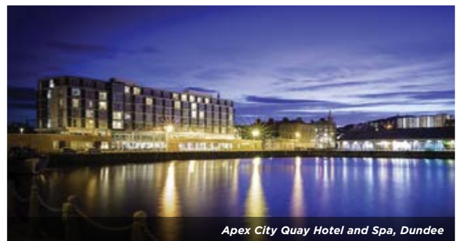
Apex City Quay Hotel and Spa, Dundee