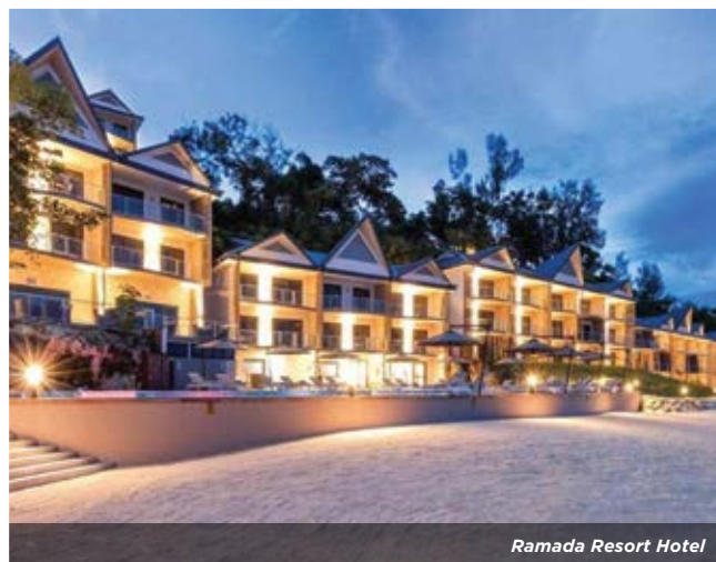
Ramada Resort Hotel