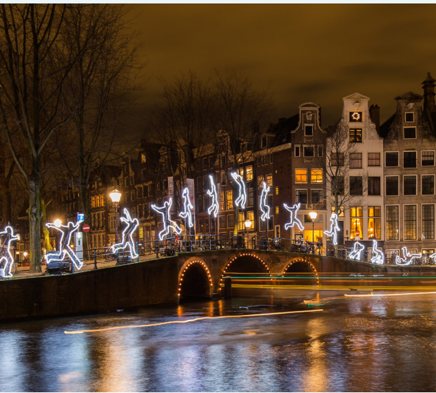
AMSTERDAM LIGHTS FESTIVAL