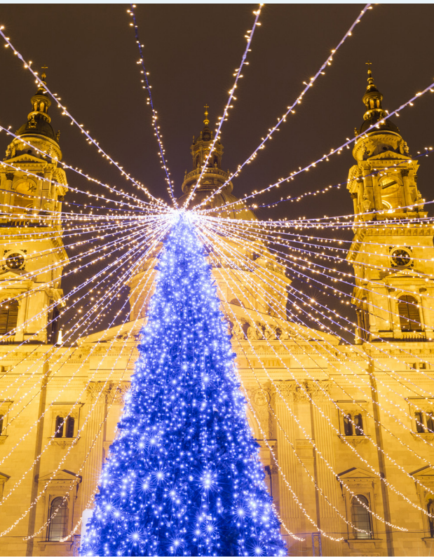
CHRISTMAS IN BUDAPEST