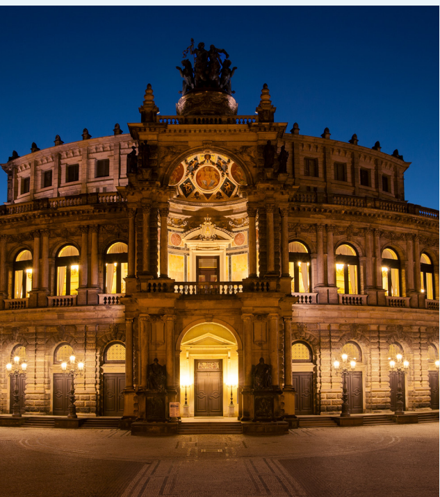
SEMPER OPERA, DRESDEN