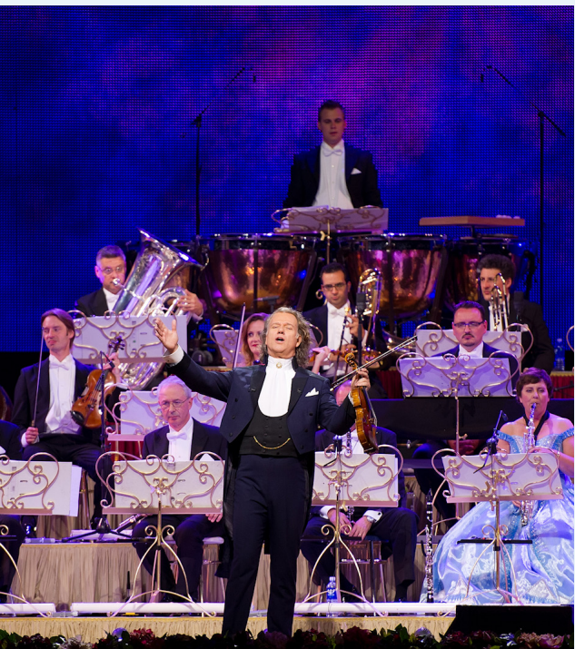
CHRISTMAS WITH ANDRÉ RIEU