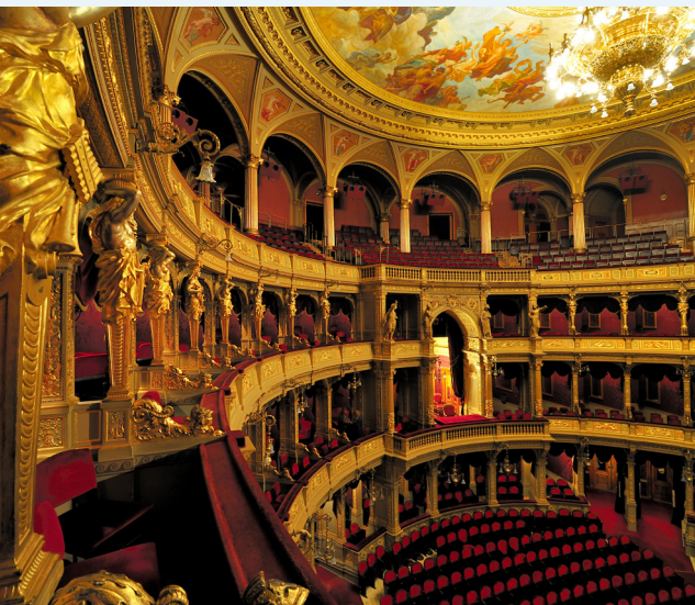
HUNGARY STATE OPERA HOUSE