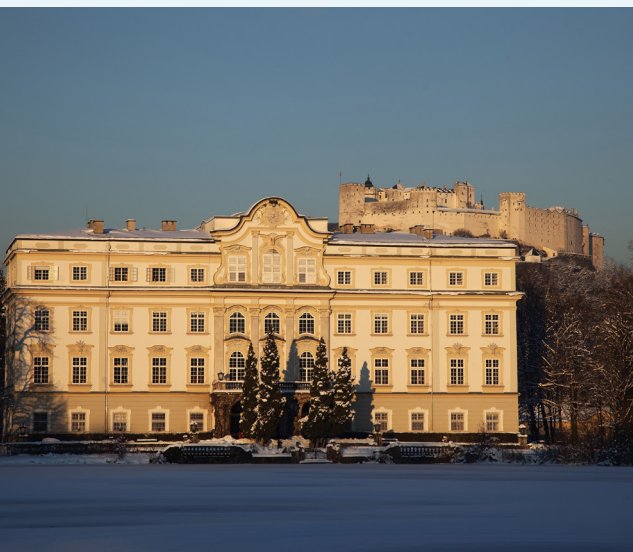
SOUND OF MUSIC PALACE