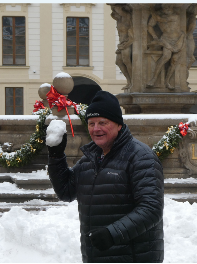
HAVE FUN IN THE SNOW