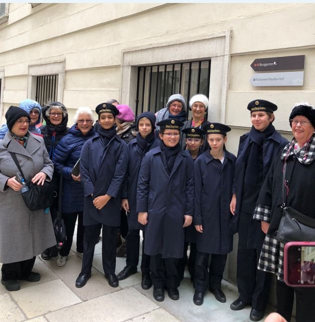
VIENNA BOYS CHOIR