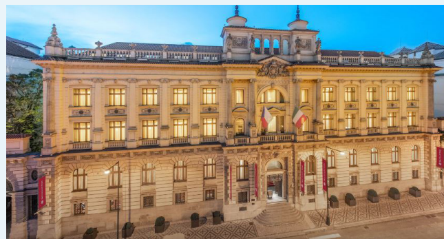
CARLO IV DEDICA ANTHOLOGY HOTEL