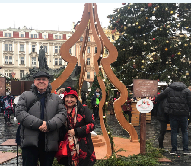
CHRISTMAS MARKETS IN BUDAPEST