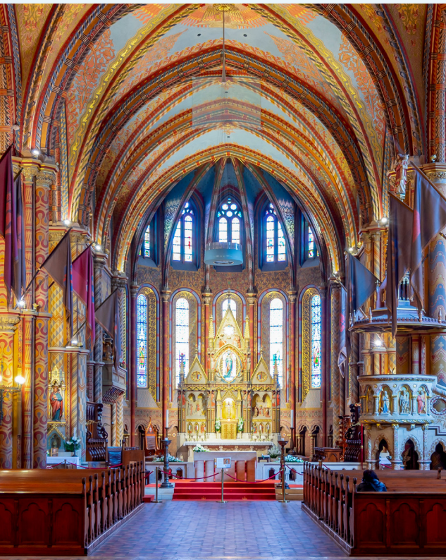
ST MATTHIAS CHURCH