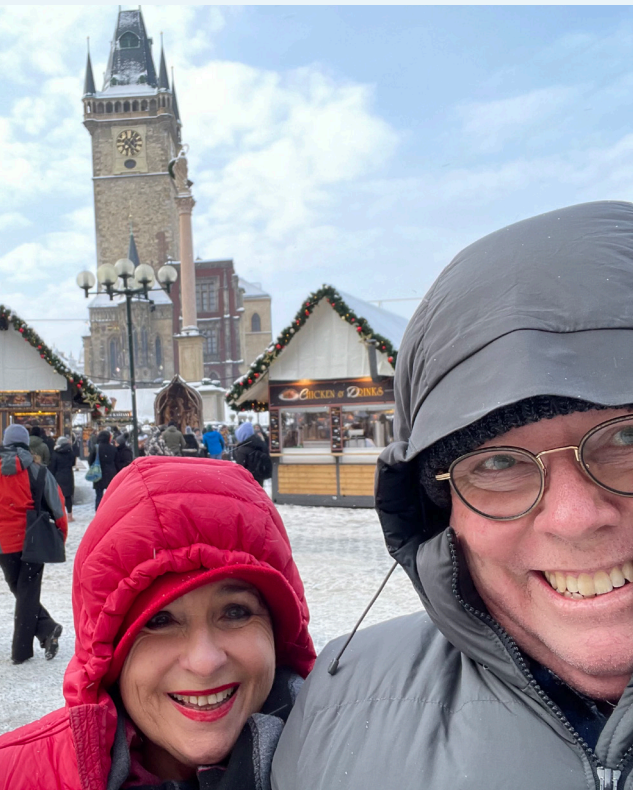
TIME FOR A MULLED WINE?