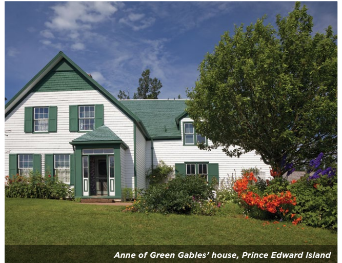
Anne of Green Gables' house, Prince Edward Island