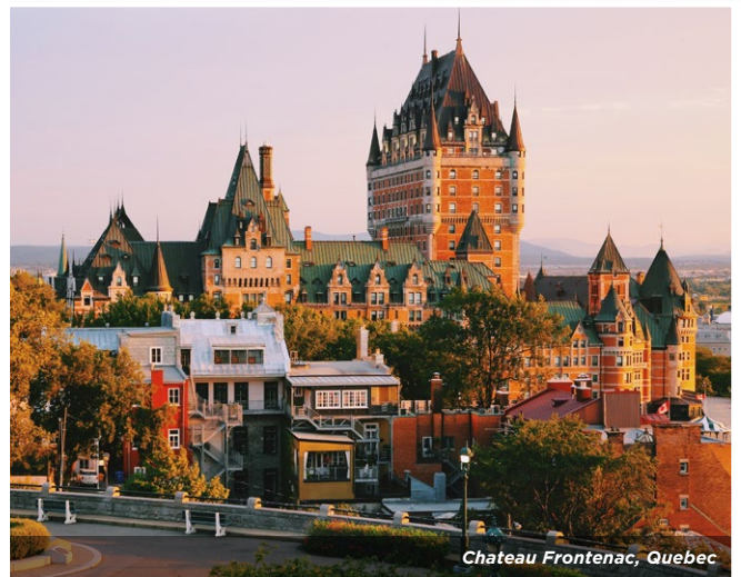
Chateau Frontenac, Quebec