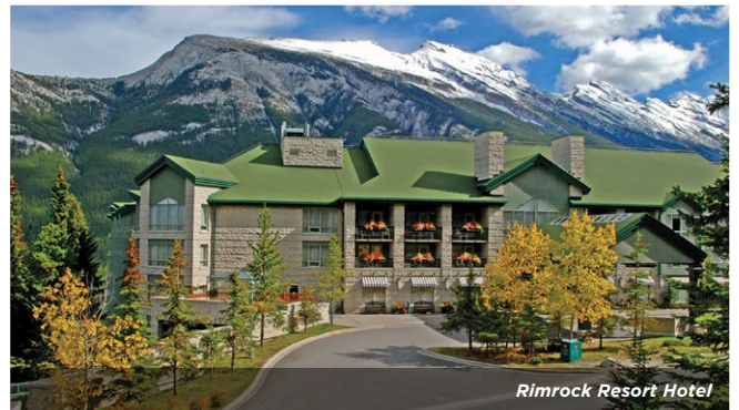
Rimrock Resort Hotel