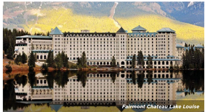
Fairmont Chateau Lake Louise