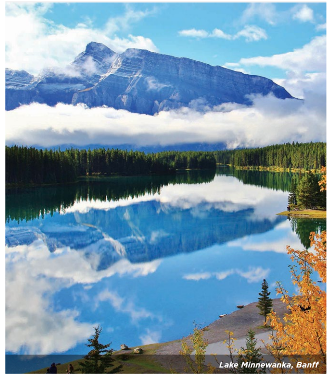
Lake Minnewanka, Banff