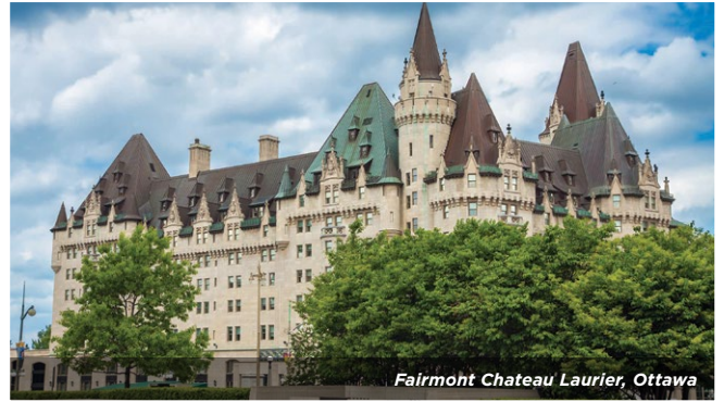
Fairmont Chateau Laurier, Ottawa

The Sutton Place Hotel, Vancouver is a beautiful boutique style hotel situated in the heart of downtown Vancouver, filled with elegance, European charm and hospitality.