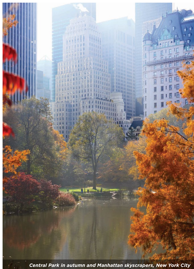
Central Park in autumn and Manhattan skyscrapers, New York City