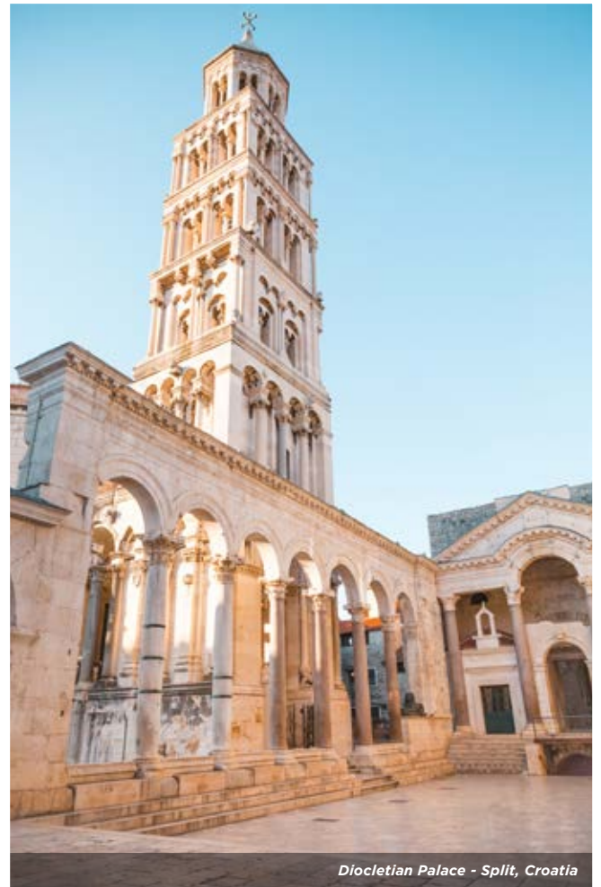
Diocletian Palace - Split, Croatia