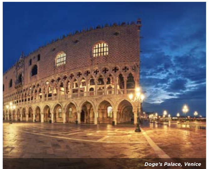
Doge's Palace, Venice