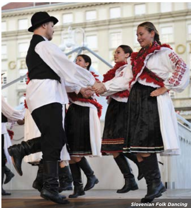
Slovenian Folk Dancing