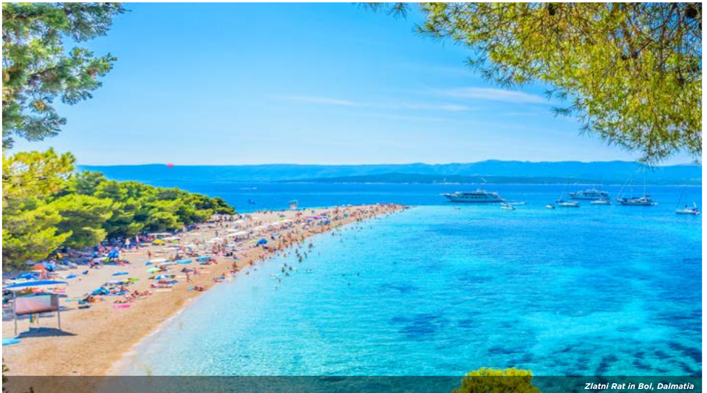
Zlatni Rat in Bol, Dalmatia