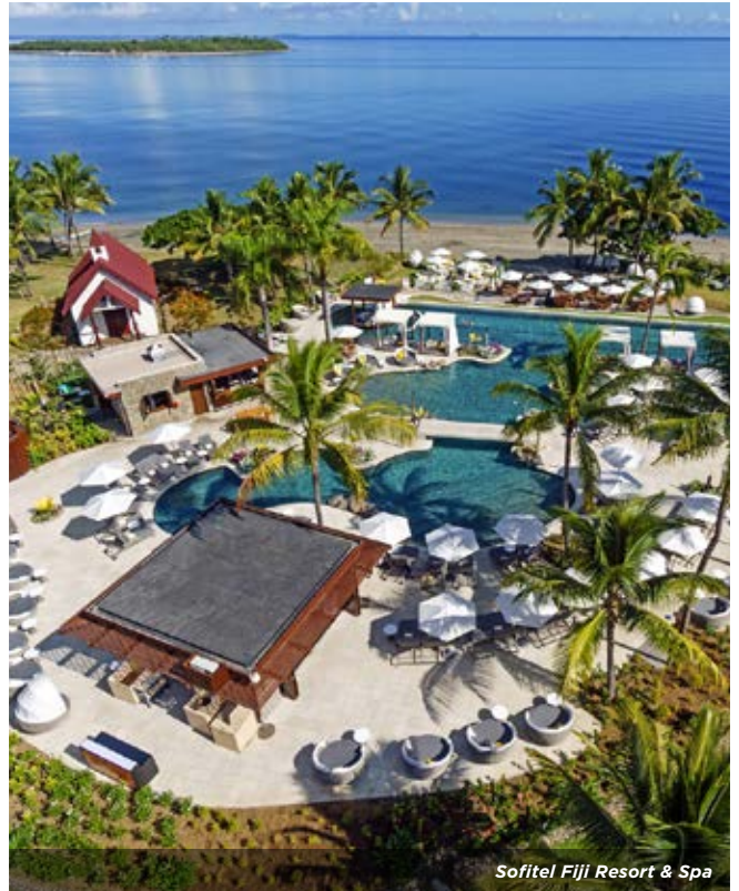
Sofitel Fiji Resort & Spa

The small size is just one of the things that makes our chartered exclusive cruise so special. Accommodating only 68 passengers, we can access bays and islands that would be impossible to reach in a large ship. We can get so close to shore that we can tie off on a coconut tree and you can swim to the beach! No matter which beach or island we visit we won't be overwhelmed by crowds, as most of the time we are the only people on the beach! Not only that, each crew member sings and plays guitar or ukulele so we will have truly musical experiences with, of course, fantastic music from us as well!