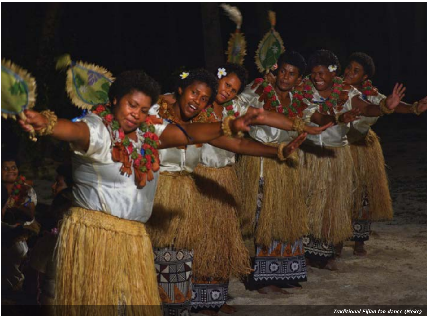
Traditional Fijian fan dance (Meke)