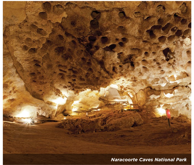
Naracoorte Caves National Park