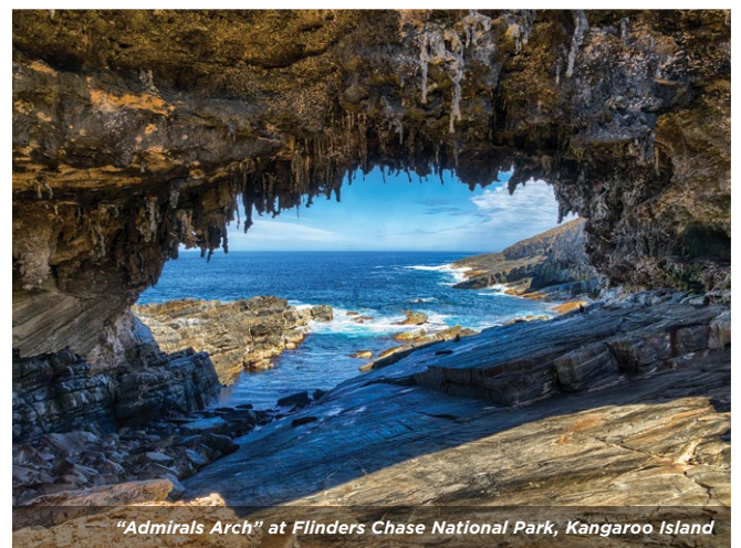
"Admirals Arch" at Flinders Chase National Park, Kangaroo Island