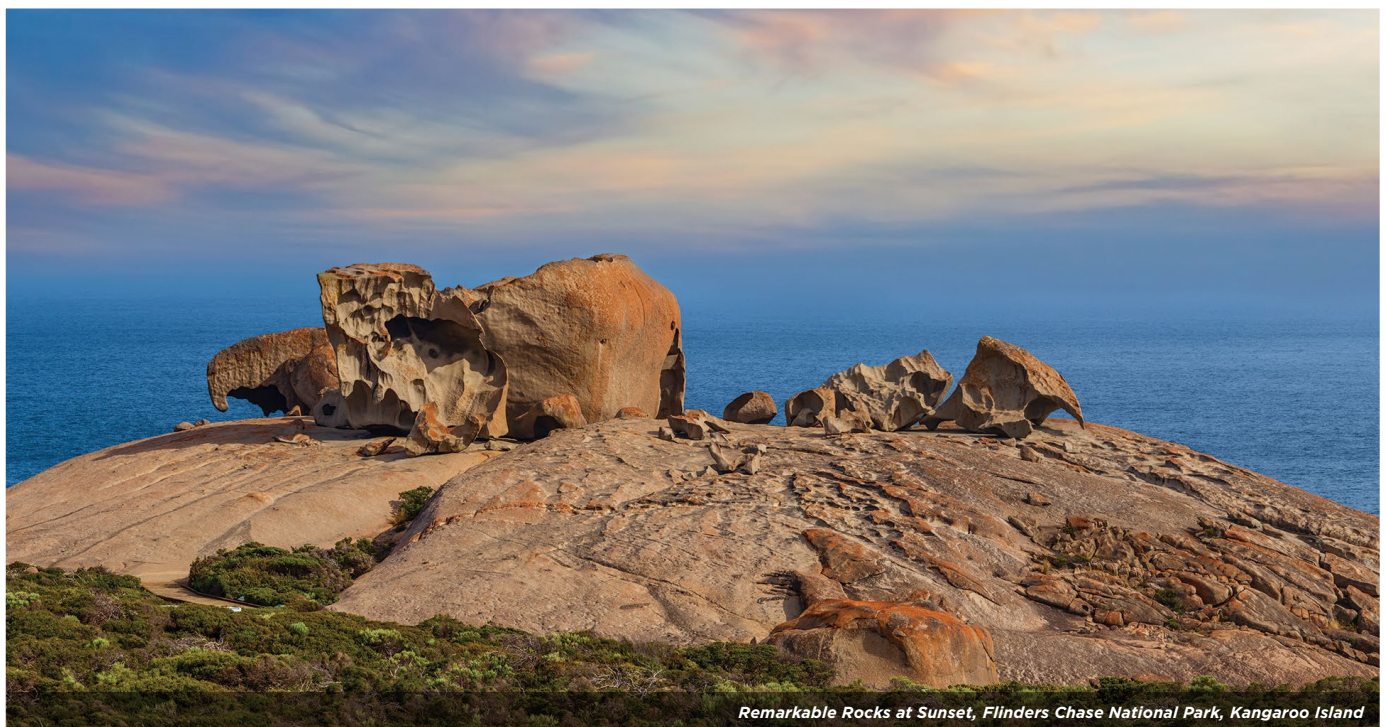
Remarkable Rocks at Sunset, Flinders Chase National Park, Kangaroo Island