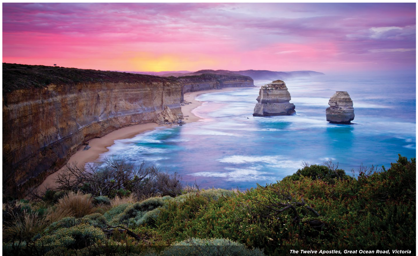
The Twelve Apostles, Great Ocean Road, Victoria