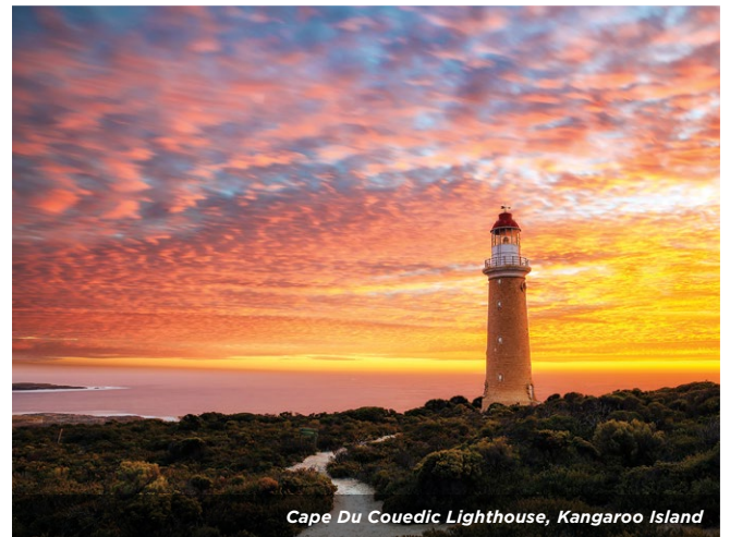
Cape Du Couedic Lighthouse, Kangaroo Island