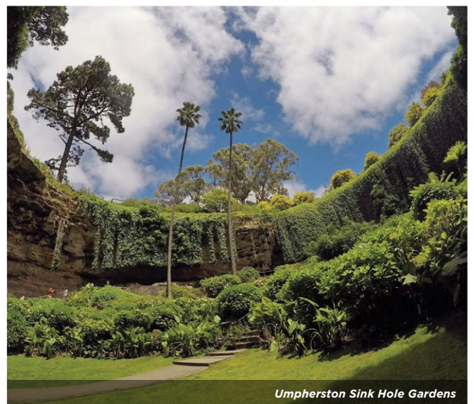
Umpherston Sink Hole Gardens