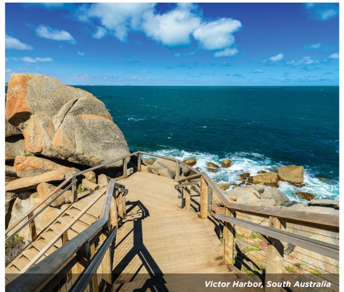
Victor Harbor, South Australia