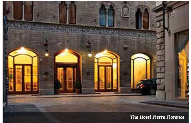
The Hotel Pierre Florence

Due Torri Hotel, Verona is a 5 star historic hotel set in the heart of Verona and situated a short walk from the famous Verona Arena.