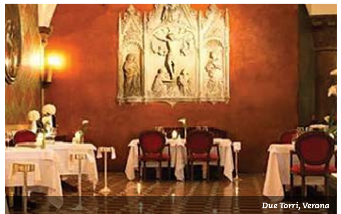
Due Torri, Verona