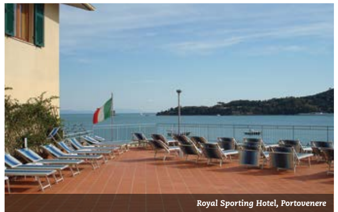
Royal Sporting Hotel, Portovenere