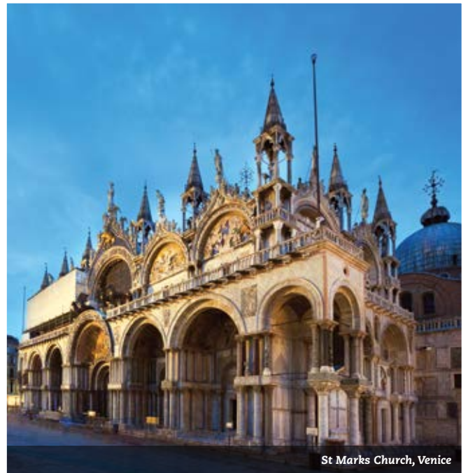
St Marks Church, Venice