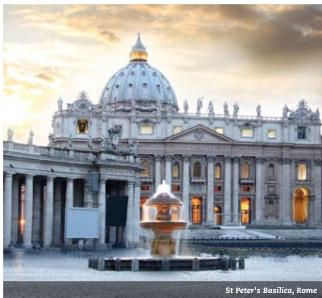
St Peter's Basilica, Rome