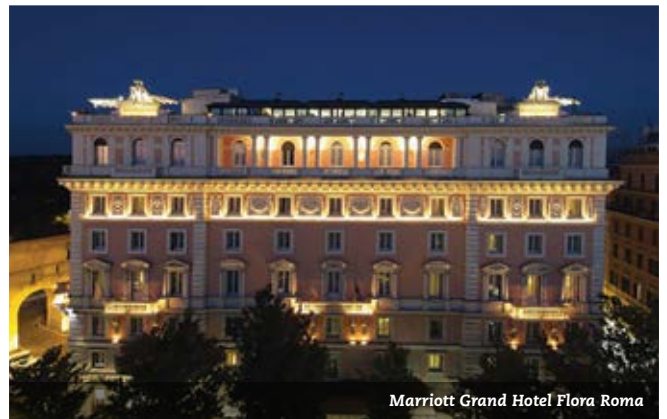
Marriott Grand Hotel Flora Roma