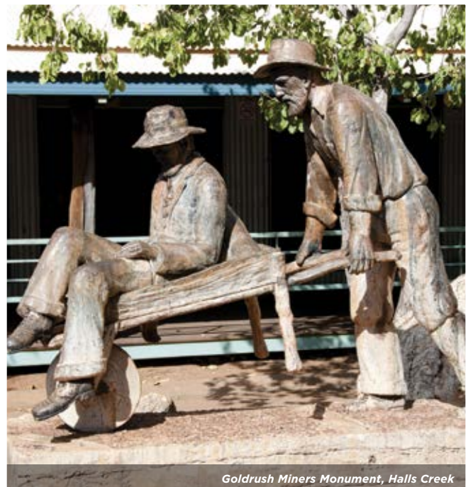
Goldrush Miners Monument, Halls Creek