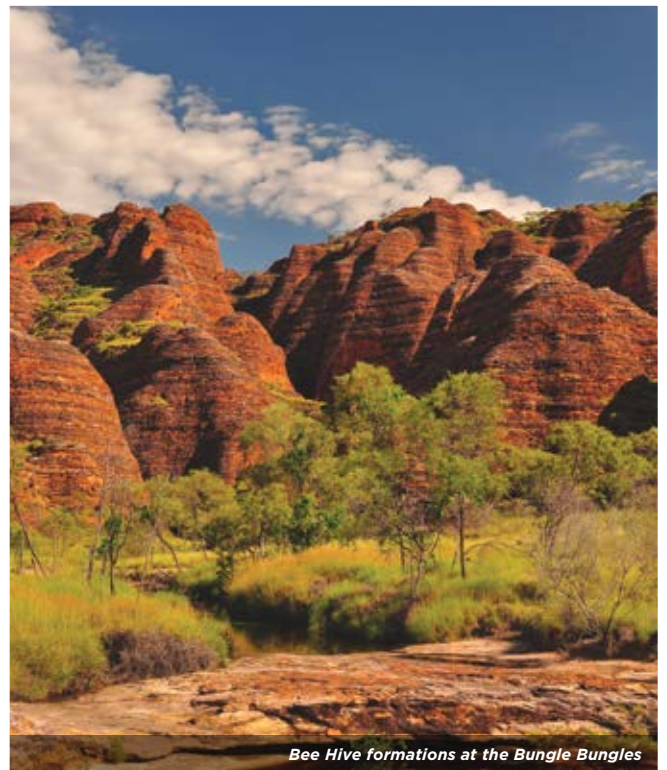
Bee Hive formations at the Bungle Bungles