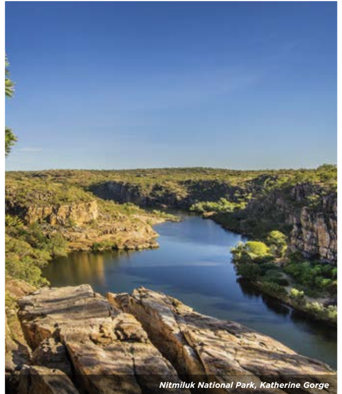
Nitmiluk National Park, Katherine Gorge