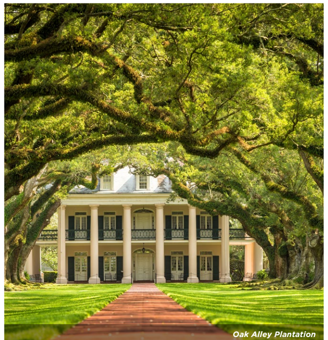
Oak Alley Plantation

Shore Excursion: The famous ancient oaks bordering the path to the mansion are our first sight upon stepping ashore. The perfectly aligned 300 year old trees form a canopy which set a particularly grand entrance for our arrival. Southern belles enjoying the shade of the leafy canopy greet us on arrival and are our guides for the day. In small groups, we wander through the antebellum plantation's many stately rooms and learn why it has earned the name "Grande Dame of the Great River Road." After the tour, we are invited to a special gathering with mint juleps on the west lawn before a visit to their popular gift shop which is known for their world-famous pralines.