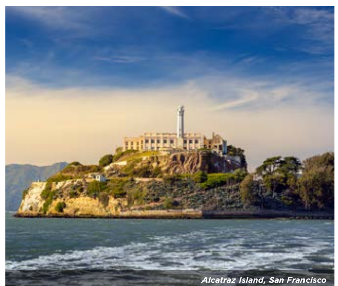
Alcatraz Island, San Francisco