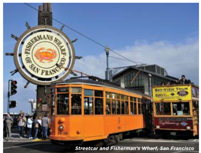
Streetcar and Fisherman's Wharf, San Francisco